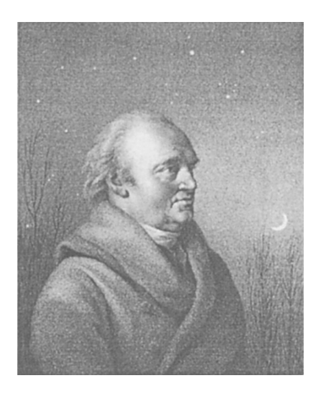
Figure 3. Sir William Herschel, the man who coined the term 'binary star' and the first astronomer to observe orbital motion.

where he showed that the change in position of the components was real and due to orbital motion. Within a year, he had analysed a set of fifty additional double stars, most of which turned out to be real binaries.