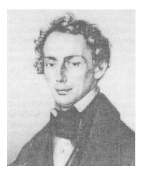
Figure 4. Christian Doppler, the man who in 1842 discovered the Doppler effect, inspired by the colours of binary stars.