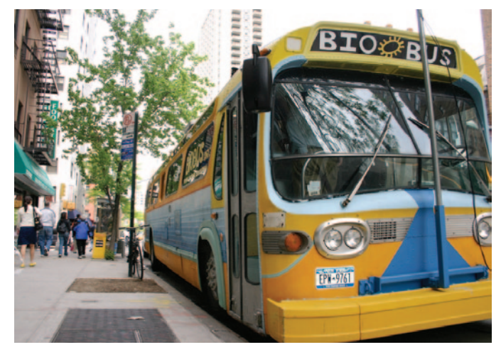
Figure 1: The Biobus in New York City.

The first group of students arrives just as Dubin-Thaler picks up a vial containing sugar, water, yeast, and bacteria—the sample we are to use today. It's frozen solid. Without missing