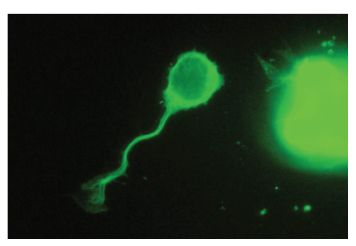
Figure 2: Microscopes on the Biobus produce high-quality images like this fluorescence image taken on an Olympus DP12.