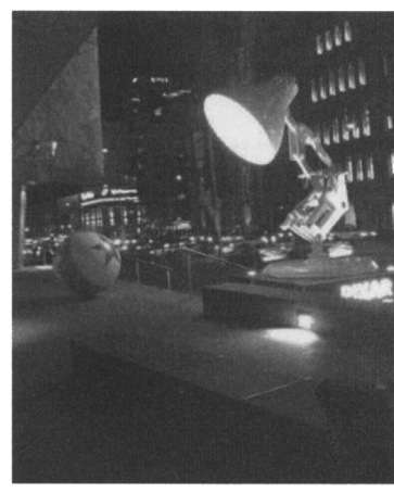
Pixar animation film festival, Australian Centre for the Moving Image, Federation square, Melbourne.

budget. It's a small amount of money compared to what I'm used to which makes it all the more important to have him involved. I also attended the Library User Group meeting in the historic New Cross Town Hall. Here I met all of the other departmental library representatives.