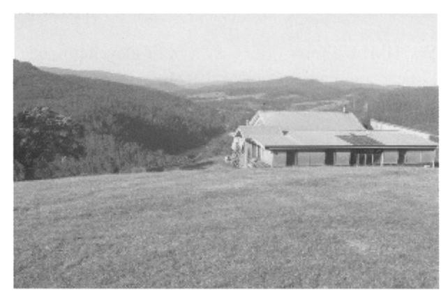
East Gippsland landscape.