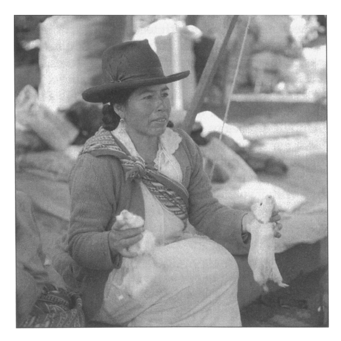
Illustration 3. This vendor in Huaraz, Peru, buys cuys raised in traditional kitchens and then sells them in the marketplace.