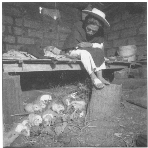
Illustration 2. Many Andean families share house space with their cuys to keep them safe from weasels, opossums, and foxes. This Ecuadorian household keeps its cuys under a platform bed.