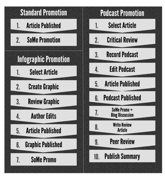
Figure 1. Graphical representation of the social media promotion process for control, infographic, and podcast groups.

All articles included in the study received standard SoMe promotion. This included a tweet from the journal's Twitter account (@CJEMonline) and a post on the CJEM Facebook page containing a link to the article and a brief (1- to 2-sentence) summary of its