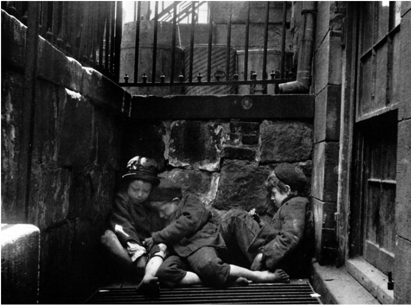
Figure 9.1 Jacob Riis, Children sleeping in Mulberry Street , New York City, 1890. Public Domain.

What disturbed the gentry was not just the indigence. It was the sensation that worlds were merging in their city but classes were diverging; it was that the differences and disparities were brought close, nearby: those hungry, needy kids from Italy or Galicia were underfoot. This was an affront to the prevailing Gilded Age narrative of welcoming at the height of nineteenth-century integration. Closing distance cast light – literally and figuratively – on widening differences that became the obsession of social reformers. The result was a recognition that, for all that steam and cables wired the world into one survival unit, it was a world of strangers. Moreover, it was seen – and hence the importance of lens-based media – as a world divided between the familiar and the strange, the civilised and the barbarian, the haves and the have-nots, sharing one, divided, planet.