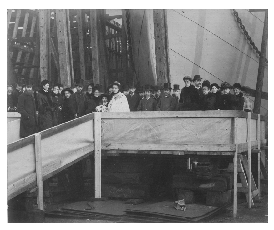
Figure 1.2 The launch of the Yamashiro-maru , Newcastle upon Tyne, 12 January 1884.

Here in the cradle of the locomotive and the railway system; in the home of the High-Level Bridge; in the birthplace of the hydraulic engine and the Armstrong gun; and in the great centre of the coal trade, where works for the manufacture of lead, iron, and glass rise up on every hand – where, with one exception, the largest ships in the world have been built, and where alone in England the beauties of Continental Street architecture are worthily rivalled, the illustrious [Japanese] party whom we entertain today will find the real secret of England's greatness among nations.<sup>15</sup>