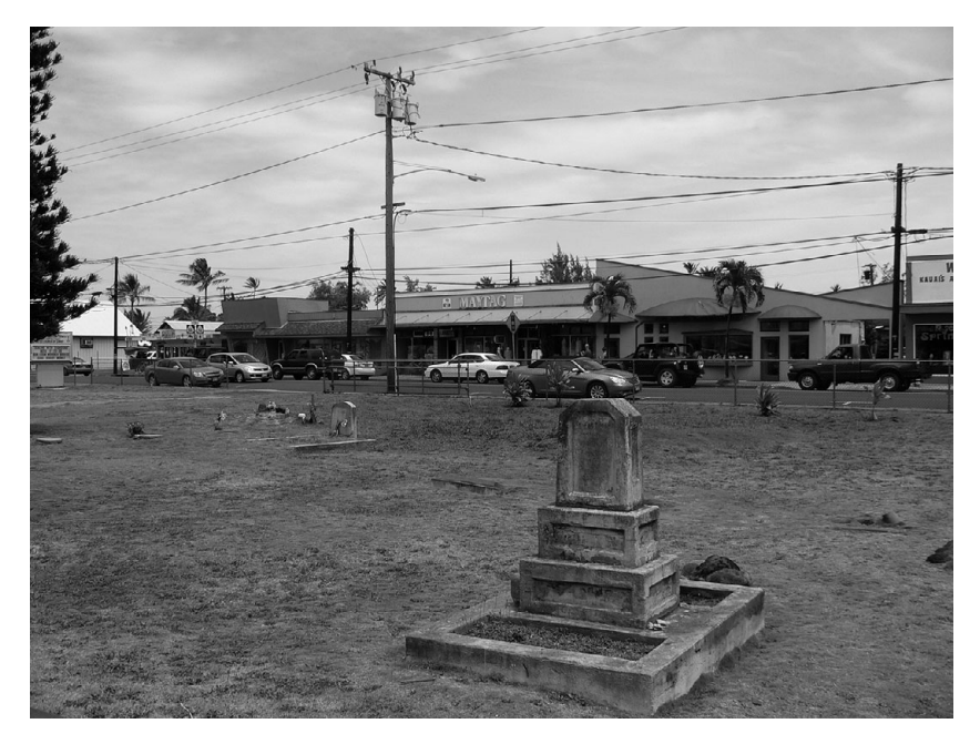
Figure 1.1 Graveyard of the First Hawaiian Church, Kapa'a. Author's Photo, 2011.

KEIJIRO, KODAMA ARRIVED HAWAII, NEI JUNE 18, 1885 DIED KAPAA, KAUAI MEIJI XXIX JULY 9, 1896