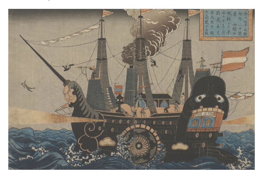
Figure 1.4 'Depiction of a Foreign Ship' (Ikokusen-zu 異国船図).

aforementioned embassy to the United States used a similar analogy in New York, when the ambassadors' departure coincided with the arrival of the Great Eastern on its maiden transatlantic voyage: the British ship, he wrote, 'was like a mountain protruding from the sea'. Another of the mission's diarists inadvertently echoed the press coverage of the Great Britain 's arrival in New York fifteen years previously when he described the Great Eastern as a 'mammoth [kyodai naru 巨大なる] British merchant steamship'. 75