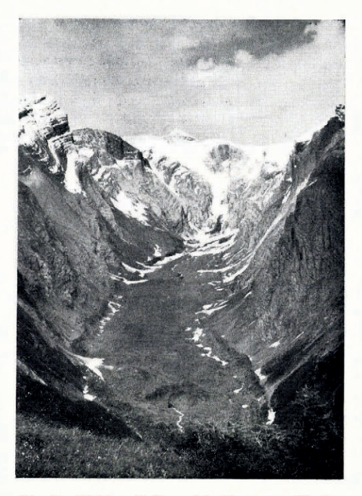
Fig. 3. Hidden Valley with Stagnant Glacier. Mt. David Lloyd George, the highest peak of the Lloyd George Mountains, in the background