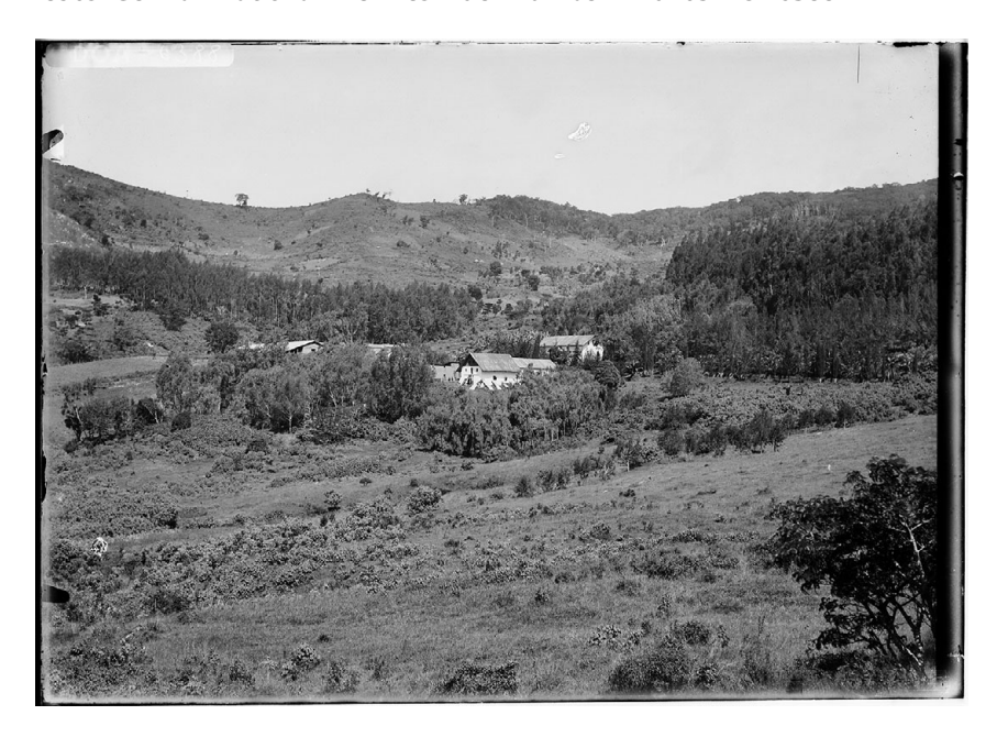
Figure 1. Kwai Farm, West Usambara Mountains, c. 1913. Photograph by Walther Dobbertin. As with Gare Mission, the Kwai experimental farm is covered with exotic tree species. Note the remains of the experimental Eucalyptus grove in the upper right quadrant planted by Emil Eick in the late 1890s, German National Archives index number: Bild105-DOA6388 TIF.

differed significantly between the settler and indigenous communities in the 1910s.