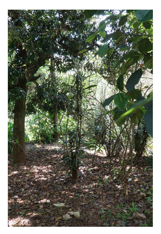
Figure 5. Mzee Yambazi's Agroforest. Dracaena mark a recent grave site.

From the Google Earth view, Mzee's seven acres are largely covered by tree canopy anchored by a couple of large Albizia trees, whose leaf fall fixes soil nitrogen, along with fruit trees of various types. Looking from the ground up, one sees a tree canopy covered by a huge netting of lianas that will yield the kwema nut.<sup>28</sup> Underneath this canopy, Mzee cultivates bananas of several types, along with yams, beans, and medicinal plants. Mzee had left some acreage unshaded and in 2019 planted a crop of maize on the open gentle slopes facing the plains to the south. Mzee Yambazi inherited the shamba from his ancestors, who are interred in a sacred space within it, the graves surrounded by dracaena plants, as in Figure 5. In the complex botanical collection of useful forest trees,