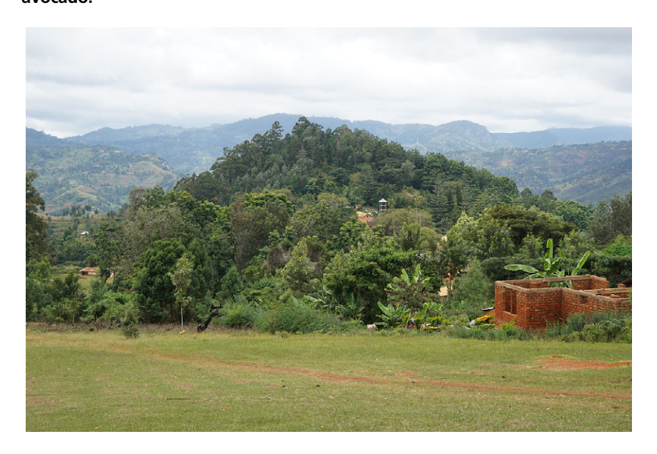
Figure 3. Gare Mission, 2016 (compare with Figure 2). A far less open landscape greets today's visitor. On the hillside behind the Mission, exotics like Eucalyptus, Grevillea, Norfolk Pine, and Jacaranda, to name a few, have grown into a forest that serves as a site for festivals and pilgrimages. In the foreground, farmers have now established shambas on a section of the former mission property where they have planted small gardens of banana and avocado.

Taking repeat photographs in local settings draws attention. On several occasions, concerned citizens approached us to ask for an explanation of our tromping around their neighborhoods. From our conversations, it seemed to me that some people perceived us as the equivalent of land surveyors. And, in a very real sense, the camera took measurements, an act that has historically raised suspicion in the mountains. We even drew small crowds at Mlalo, a fairly cosmopolitan town. In order to temper the spectacle, we took time to show people the Dobbertin views and to explain our intentions at great length. This calmed people, even piqued their interest, and sometimes netted us new contacts.