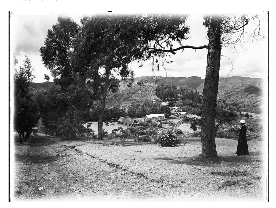
Figure 2. Gare Mission, West Usambara Mountains, c. 1913. Photograph by Walther Dobbertin. At the Trappist monastery, the vegetation is almost entirely exotic, including Eucalyptus in the foreground and lining the roadway leading to the mission complex. German National Archives index number: Bild105-DOA164 TIF.

control initiatives in favor of a laser focus on tree planting across steep hillsides. Finally, in 1999, the German government's Gesellschaft für technische Zusamenarbeitung (GTZ) claimed success and finally walked away from northeastern Tanzania after thirty years, leaving behind the Grevillea and Eucalyptus as reminders.