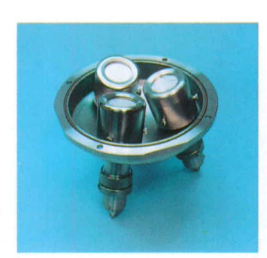
Three 'converging' TRS 2 guns