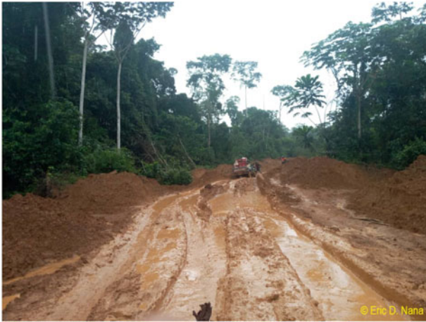
Cameroon government once more opens way for logging in the biodiversity rich Ebo Forest, a Key Biodiversity and Tropical Important Plant Area.

work because there are no law enforcement agents present to prevent large-scale poaching facilitated by logging. It is not a priority for logging companies. The management strategy of Conservation Enclaves within Forest Management Units needs revamping. We fear therefore that this decision will lead to extirpation of threatened and rare species such as Preuss's red colobus Piliocolobus preussi (with only two remaining populations, one of which is in the Ebo forest), the Goliath frog Conraua goliath (the largest living frog), the culturally unique Nigeria–Cameroon chimpanzee Pan troglodytes ellioti (which both fishes for termites and cracks nuts), and a potential new subspecies of gorilla occurring between the western lowland gorilla Gorilla gorilla gorilla and Cross River gorilla Gorilla gorilla diehli . One hundred and fifty-six threatened and 14 new plant species have been recorded in this forest since 2004 by the Royal Botanic Gardens, Kew and the National Herbarium of Cameroon.