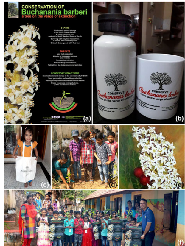
Conservation and education campaign for Buchanania barberi : (a) poster, (b) water bottle and mug, (c) bag, (d) seedling planting, (e) painting by Reema Abraham, (f) school awareness campaign.

Jawaharlal Nehru Tropical Botanic Garden and Research Institute has received funding from the Mohamed Bin Zayed Species Conservation Fund, UAE, to conserve B. barberi . In March 2022 and February 2023, we conducted education campaigns about the species, engaging key stakeholders such as the Forest Range Office in Palode, the Kerala Forest Department in Thiruvananthapuram, three schools (Government high school, Jawahar Colony; Upper primary school, Karimancode; Government lower primary school, Karimancode), and the local communities