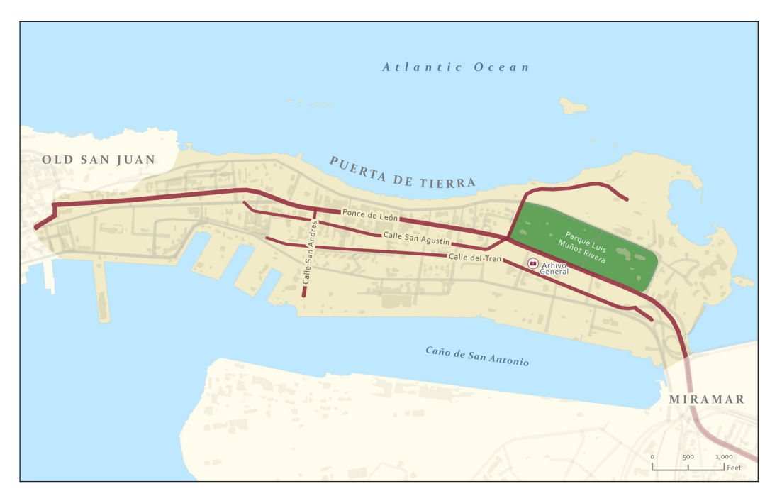
Figure 1: Map of Puerta de Tierra. Prepared by Tracy Tien, Post-Baccalaureate Spatial Fellow, Spatial Analysis Lab, Smith College.

neighborhood from the rest of the city.<sup>7</sup> The docks and warehouses of Puerta de Tierra sat squarely between San Juan and the rest of the island. San Juan was the center of the government, and many US and Puerto Rican officials and elite families lived there. Residents of San Juan could not leave the isleta to reach the rest of the island without crossing Puerta de Tierra.