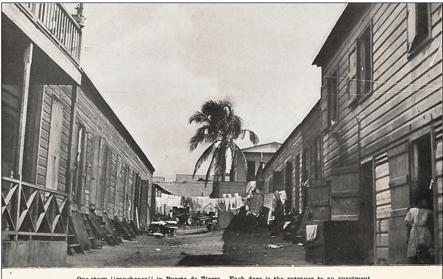
One-story "ranchones" in Puerta de Tierra. Each door is the entrance to an apartment.