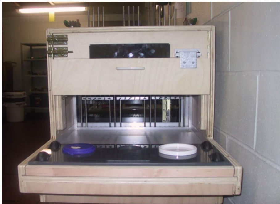
Fig. 1. (colour online) Test apparatus for cognitive assessment of felines. The apparatus consists of an enclosure where the cat was placed for 5–15 min during the cognitive test and a sliding tray with three food wells.

All cognitive testing utilised the feline general test apparatus, which is a modified version of the Toronto general test apparatus developed for use in cognitive testing of dogs (43) . The apparatus illustrated in Fig. 1 consisted of an enclosure, where the cat was placed during the cognitive tests, with a front consisting of three adjustable gates, which were set such that the cat could extend its head through the opening to reach the food well and obtain the reward. The cats were in the enclosure for 5–15 min, depending on the cognitive tests. The technologist was separated from the cat by a partition containing a one-way mirror and a hinged door through which the tray was presented. The tray contained one medial and two lateral food wells. The two lateral wells were for the landmark discrimination, size discrimination and DNMP.