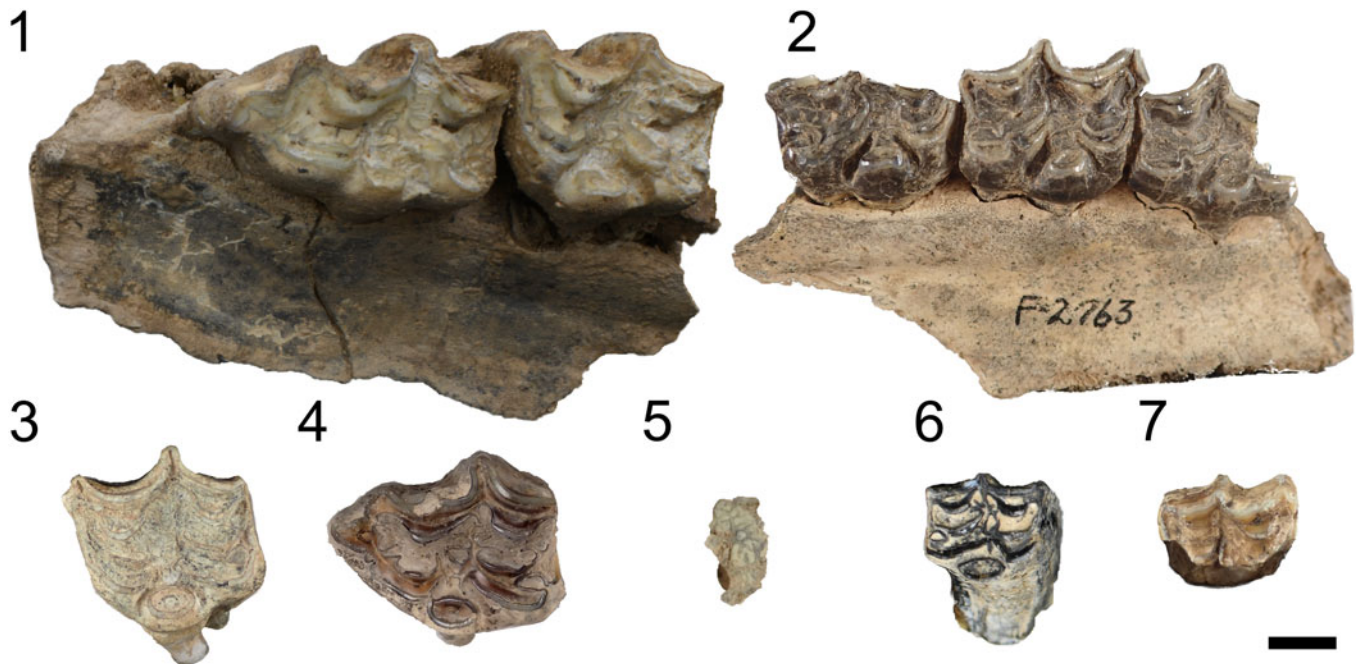
Figure 6. Equids from McKay Reservoir: (1–5) Cormohipparion sp. indet., upper dentition: (1) left maxilla fragment with P2–P3 in occlusal view (UWBM VP 61653); (2) right maxilla fragment with P2–P4 in occlusal view (UOMNH F-2763); (3) left upper cheek tooth other than P2 or M3 in occlusal view (UOMNH F-2787); (4) left upper cheek tooth other than P2 or M3 in occlusal view (UWBM VP 61573); (5) left upper cheek tooth fragment in occlusal view (UOMNH F-4156); (6) Pseudhipparion sp. indet., right upper cheek tooth other than P2 or M3 in occlusal view (UOMNH F-29959); (7) Equinae gen. indet. sp. indet., buccal half of upper cheek tooth other than P2 or M3 in occlusal view previously assigned to Neohipparion (UOMNH F-4444). Scale bar = 1 cm.

with the species means of previously described species (Table 3). Furthermore, for specimens with multiple teeth, the most similar species varied with tooth position. UOMNH F-2787 is most comparable in size to Cormohipparion skinneri but is still fairly far off. The dimensions of