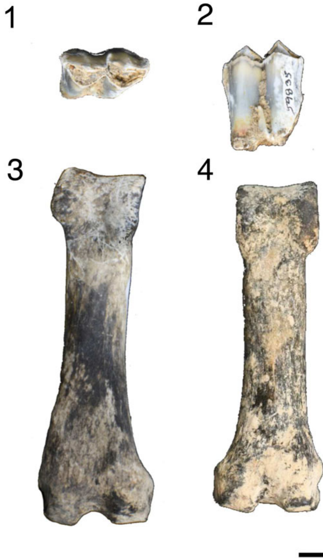
Figure 4. Pleiolama sp. indet. from McKay Reservoir: (1, 2) right m1 or m2 (SDSM 59835): (1) occlusal view; (2) lateral view; (3, 4) proximal phalanges in plantar view: (3) UOMNH F-81112; (4) UOMNH F-4154. Scale bar = 1 cm.

removing the occurrence of Neohipparion from the faunal list for McKay Reservoir.