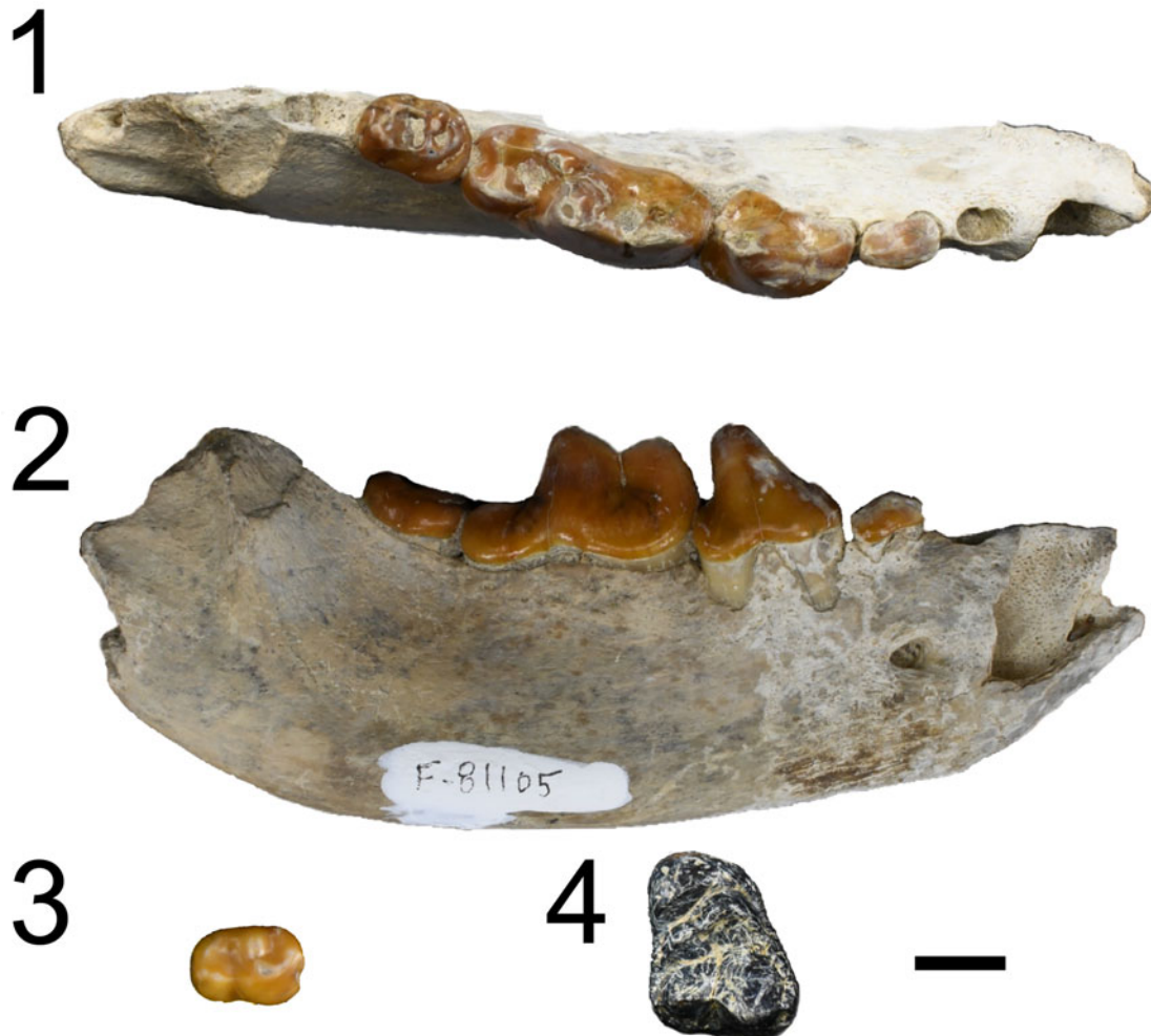
Figure 2. Borophagus secundus (Matthew and Cook, 1909) from McKay Reservoir: (1, 2) right dentary (UOMNH F-81105): (1) occlusal view; (2) lateral view; (3) right lower m2 (UOMNH F-81106); (4) left upper M1 in occlusal view (UOMNH F-29746). Scale bar = 1 cm.

Description. —Large size of teeth and presence of small m2 on UOMNH F-81105 and F-81106 suggest that specimens can be