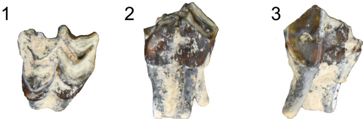
Figure 5. Dromomerycidae gen. indet. sp. indet. from McKay Reservoir, left M1 or M2 (SDSM 38459): (1) occlusal view; (2) medial view; (3) lateral view. Scale bar = 1 cm.