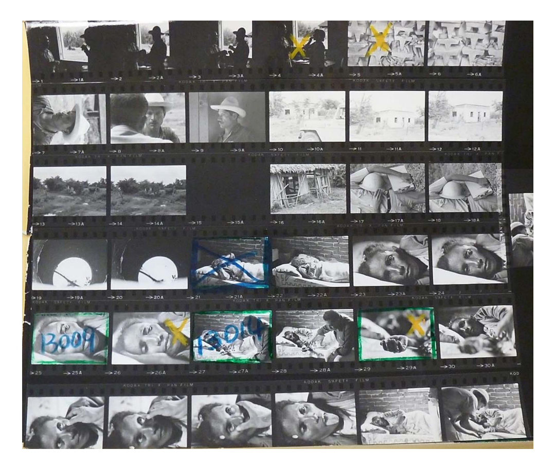
Figure 2. Contact Sheet from Peter Larson, Malaria, Mexico, 1968. Photographic Archives, Sub-fonds Photographers, WHO Archives. Copyright WHO.<sup>76</sup>

that this was not an everyday practice, perhaps used when no other alternative was available or in response to specific time pressures.<sup>77</sup> Published photographs tended to appear faithful to the originals, albeit cropped and organized in relation to text and other images. The WHO wanted the photographs to speak for themselves as an unembellished and authoritative record of health 'seen through the eyes of the WHO'. Yet, while little mechanical manipulation took place, the view was shaped in diverse ways by the instructions given to photographers, by the guides who accompanied them, by the people they photographed, and by the selection process after the films had been returned to the WHO. Indeed, as seen above, the captions and accompanying texts instructed the viewer in how to approach the images. The PIO was further complicit in skewing the picture by featuring photographs which emphasized good practice, or by including examples where programmes were fully operational. Ultimately, the process was geared towards the creation of a carefully staged drama rather than snapshots from the front lines of health.