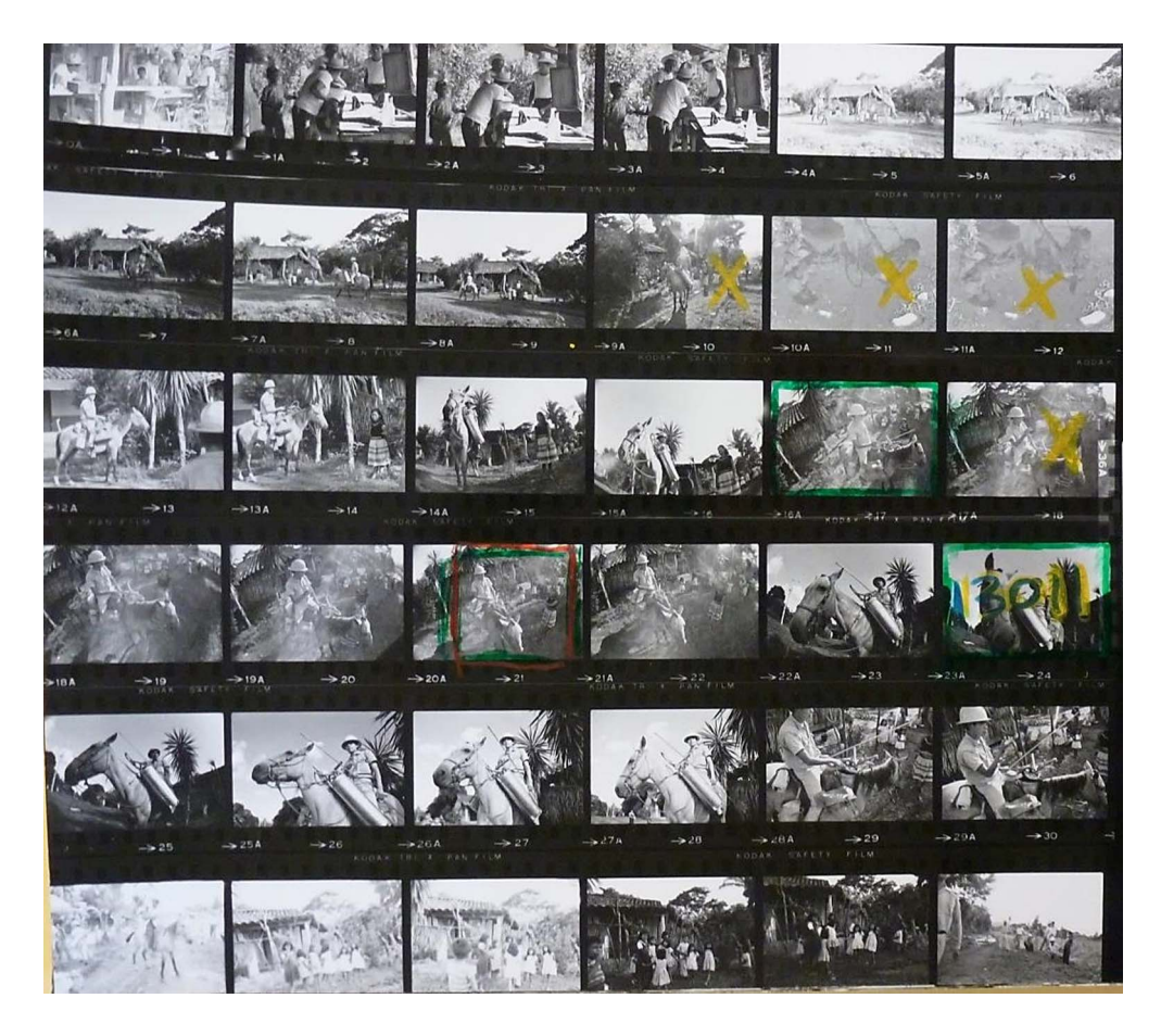
Figure 1. Contact sheet from Peter Larson, Malaria, Mexico, 1968. Photographic Archives, Sub-fonds Photographers, WHO Archives. Copyright WHO.<sup>73</sup>

officers direct the campaign from an operational headquarters, from which they deploy their spray-teams as though they were combat troops. "Supreme Headquarters" is WHO's Regional Office'.<sup>74</sup> Figure 2 displays the similar diligence applied to create a haunting photograph of one of the victims of this war. The contact sheet carries shots of the patient's alert and piercing gaze, but the crosses show how these were rejected in favour of a sleepier vision of despair and emptiness. Her hand, extended limply out towards the viewer, was preferred to more detailed shots of her examination. The text painted her as 'the face of malaria', the material impact of an 'ancient curse' which brought 'delirium, death and economic ruin'.<sup>75</sup>