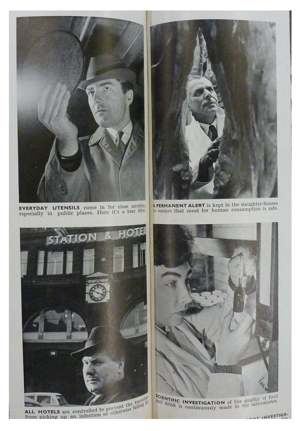
Figure 6. Detail from 'The unknown guardian angels have faces' photo story, World Health , September–October 1963, pp. 48–9.<sup>86</sup>