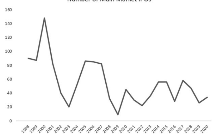
Figure 1 UK IPOs on the LSE's Main Market 1998–2020 (data derived from: London Stock Exchange, "Reports: Primary Markets, New Issues and IPOs", available at https://www.londonstockexchange.com/reports?tab=new-issues-and-ipos&accordionId=0-838a7e19-eb32-49ba-a1b5-3e4eaea7021b).

and fire the management team,<sup>57</sup> a founder may fear that early- or growth-phase investments in research and development and product-cycles, resulting in short-term share price declines, could lead to the founder being removed from the board by the public shareholders, or removed as an executive indirectly through the public shareholders' influence over board decision-making owing to their control over board composition. Similarly, a decline in share price could expose the company to a predatory takeover bid, subsequent to which the management team is changed by the acquiror.<sup>58</sup> Such fears are especially pertinent in the realm of high-growth tech-companies where forth-coming innovative products may need to be kept confidential,<sup>59</sup> and where the correlation between medium-to-long-term investment and future benefit may not be easily observable to public shareholders,<sup>60</sup> who accordingly undervalue the company. After all, a corollary of the assumption that