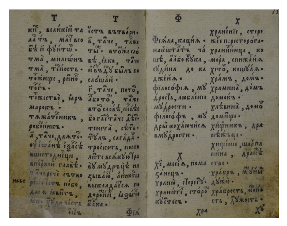
Figure 2. The definition of "philosophy" and "philosopher" in the lexicon of Lavrentii Zyzanii's Slavonic primer ( Azbuka , 1596). I.7.12, fol. Γ8r.

lights" of dissimulation glimmer throughout the rubrics and rules of these two works. Some subtle probing is required to pinpoint the absences and consider their import.