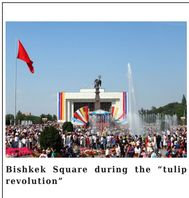
Bishkek Square during the "tulip revolution"