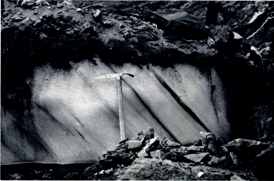
Fig. 6. Glacial ice in the core of the Arapaho rock glacier, exposed 400 m. down-valley from the base of the cirque head wall. Bands of dark-colored ice, probably representing annual ablation surfaces, dip up-valley at angles of 40 to 45°; 21 August 1964

ablated more rapidly than debris-charged ice near its terminus. In this manner, a spoon-shaped depression formed at the rear of the glacier and a tongue-like lobe of ice, protected by a veneer of overlying debris, was preserved at its front. (3) A second ice tongue advanced into the topographic low formed by the spoon-shaped depression, overrode the morainal material in front of it and then stagnated on the surface of the older lobe. Later ice advances contributed additional lobes to the growing rock-glacier complex.