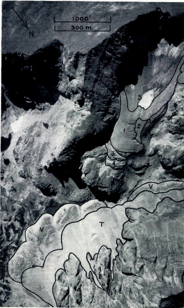
Fig. 2. Vertical aerial photograph of rock glaciers in the Middle St. Vrain Valley. A cirque-floor rock-glacier complex, probably of Gannett Peak age, is in the upper right-hand corner of the photograph. The complex consists of four superimposed lobes, numbered 1, 2, 3 and 4 in order of increasing age. A spoon-shaped depression (S) at the rear of the complex is bounded by Gannett Peak lateral moraines. Valley-wall rock glaciers (V) in the lower part of the photograph have been partially obscured by Gannett Peak talus (T), and are probably of Temple Lake age. (Photograph by Falcon Air Maps, Denver; 24 September 1963)

beneath cirque head walls represent the debris-covered tongues of true glaciers that formerly occupied the floors of these cirques. Our reasons for this conclusion are: