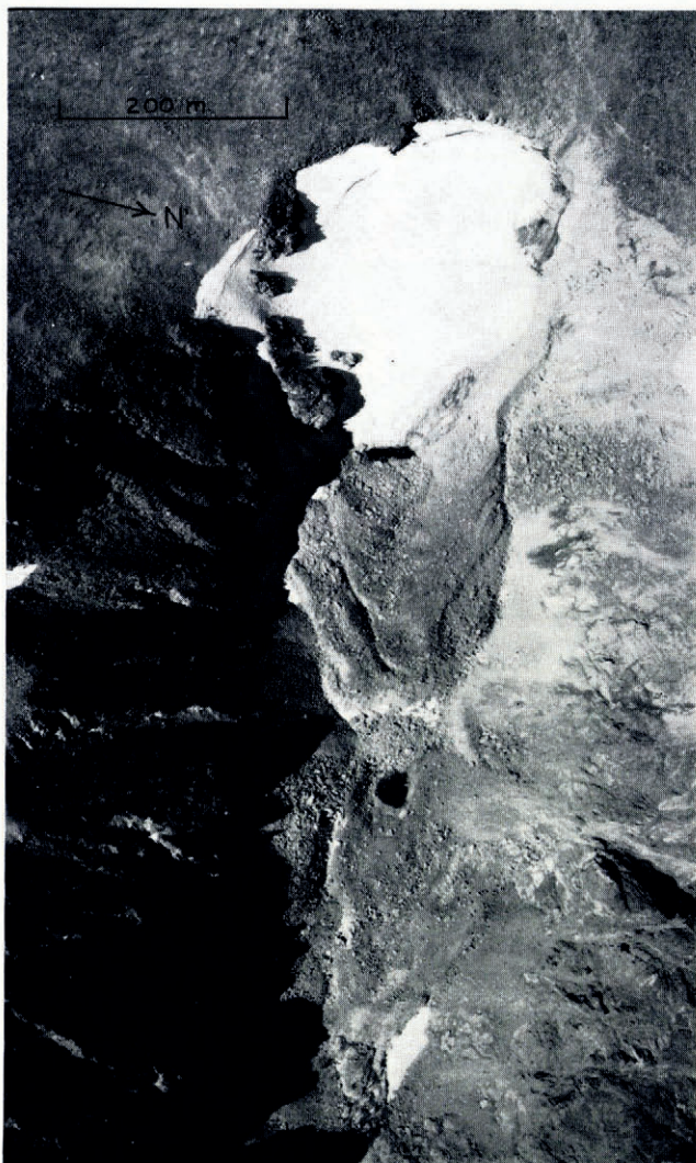
Fig. 4. Vertical aerial photograph of Tyndall Valley, Rocky Mountain National Park. A cirque-floor rock-glacier complex of Gannett Peak age lies immediately below Tyndall Glacier. An older, Temple Lake, complex occurs lower in the valley. Lateral moraines of the older complex are partially obscured by talus and mud-flow deposits. A small lake occupies the spoon-shaped depression at the rear of the older complex. (Photograph by Falcon Air Maps, Denver; 23 September 1962)

wall, is definitely of glacial origin; bands of dark-colored ice, probably representing annual ablation surfaces, dip up-valley at angles of 40 to 45° (Fig. 6).