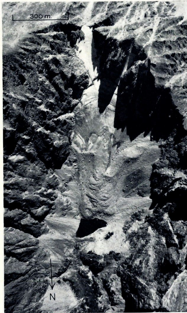
Fig. 5. Vertical aerial photograph of a cirque-floor rock-glacier complex below Fair Glacier. Sparse vegetation and fresh topography suggest that the complex formed during Gannett Peak time. The lake below the terminus of the rock glacier is dammed by a terminal moraine of Temple Lake age.

Unpublished movement measurements made by H. A. Waldrop and J. B. Benedict on the Arapaho rock glacier suggest that the present rock-glacier complex now moves as a single unit. Measurements were made along a line crossing two distinct lobes (Fig. 3). Down-slope movement was greatest at the axis of the complex and decreased uniformly to both sides. There was no suggestion of differential movement between the two lobes. Because the radii of curvature of transverse ridges and furrows differ from lobe to lobe, the ridges and furrows on each lobe must have developed while there was still a certain degree of independent movement.