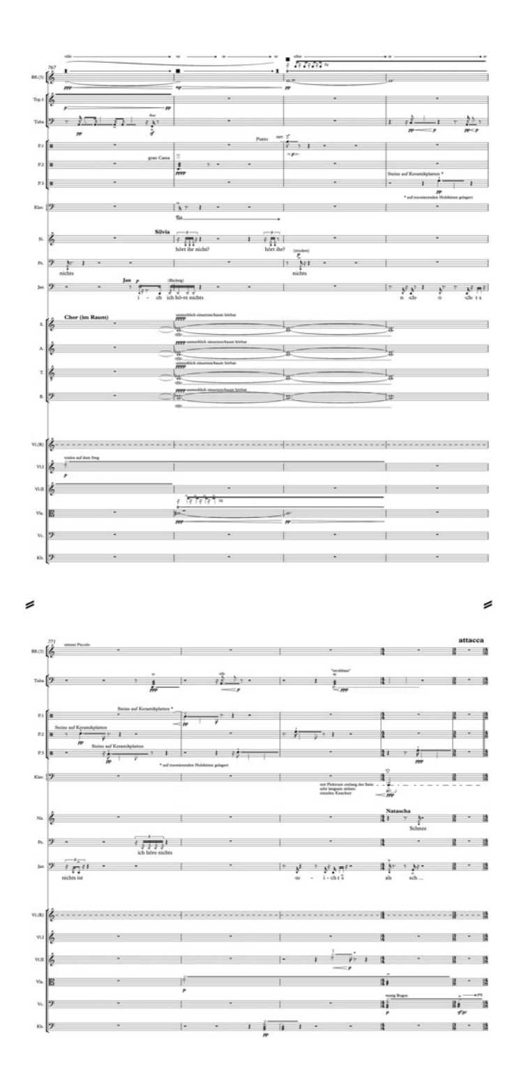
Example 2: Continued.