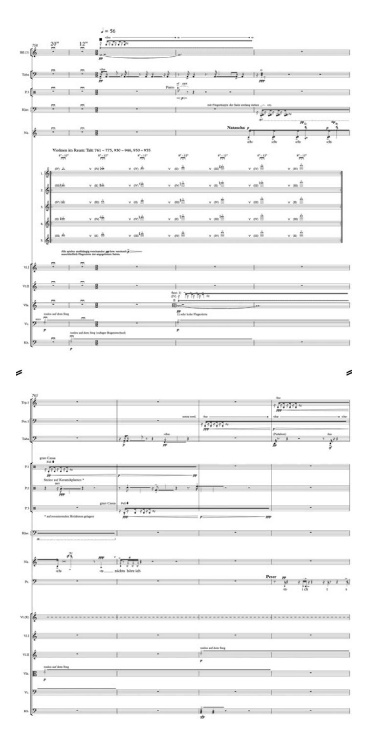
Example 2: Snow as a sonic metaphor in Violetter Schnee (Act I, Scene 15), bars 758–75. © Bärenreiter Verlag; used with permission.