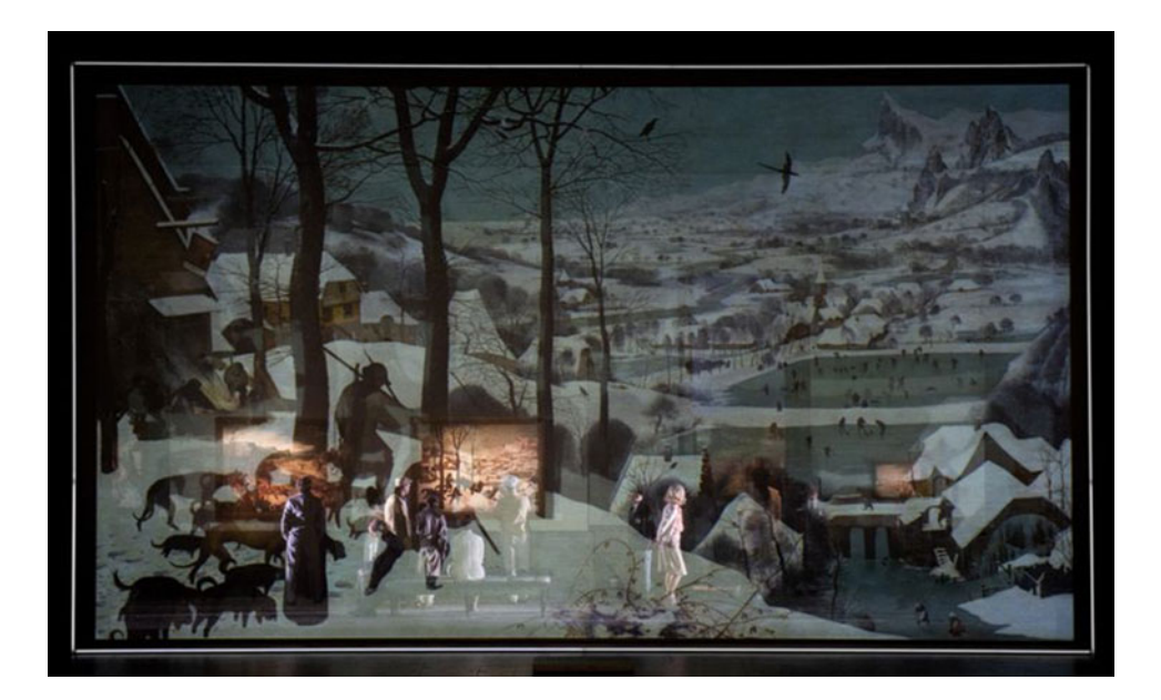
Figure 2: Brueghel as a central image in Claus Guth's stage design for Beat Furrer's Violetter Schnee (2019).

the ecological realities of climate change. In her autobiographic novel The Faraway Nearby (2013), Rebecca Solnit describes the deep uncanniness of an arctic landscape: