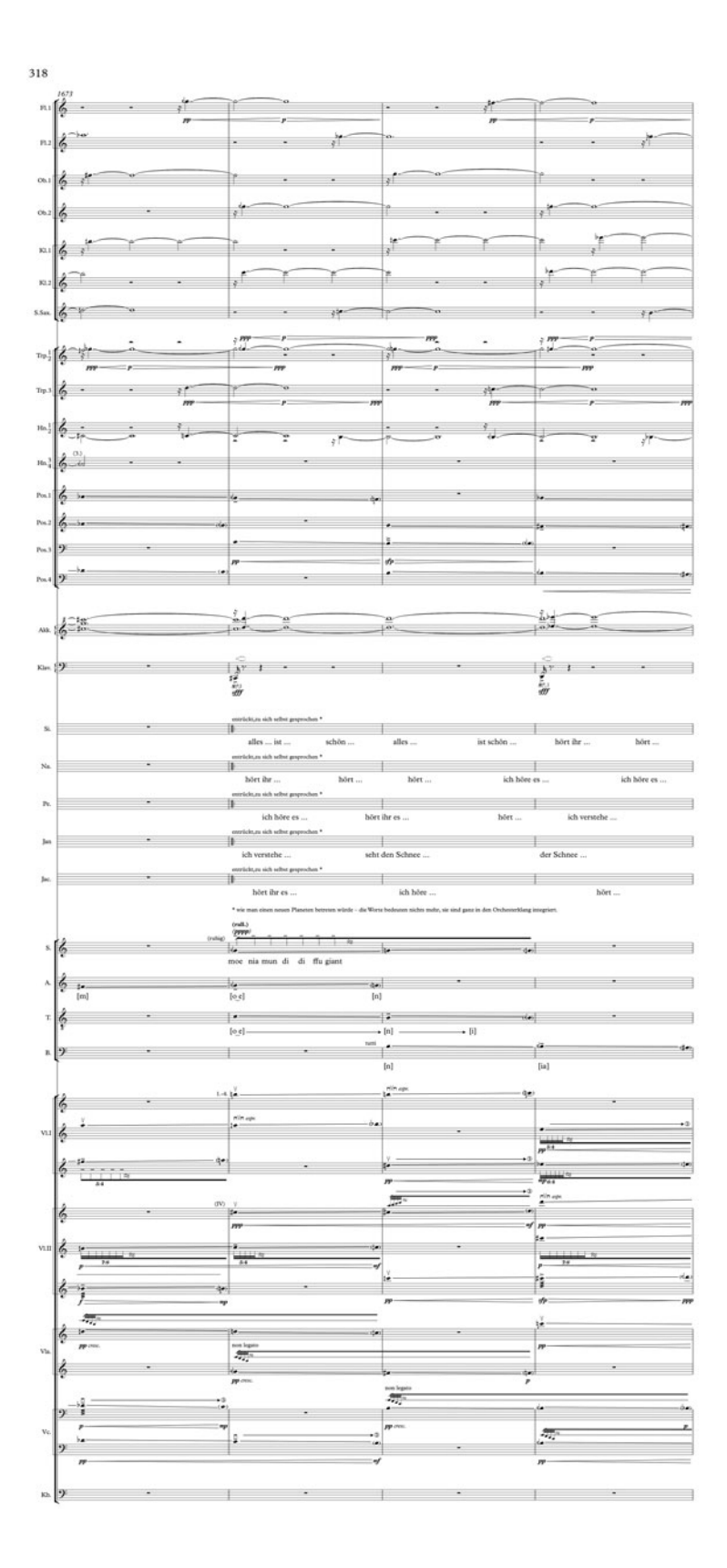
Example 3: Loss of the individual into the collective: Violetter Schnee (Act IV, Scene 34), bars 1673-ff.