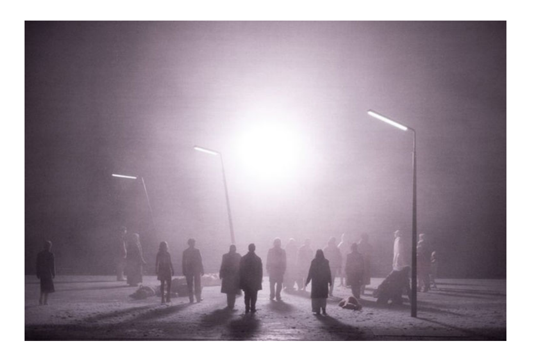
Figure 3: Heavy snowfall blurs the vision in Claus Guth's stage design for Beat Furrer's Violetter Schnee (2019).

face with a giant ball of light that is falling down from the sky. Their vision is blurred and eventually, for just a brief few seconds, everything turns purple and, more importantly, silent. Straight after that, everything goes dark. Has the world as we know it come to an end? And if so, does that mean humankind will not survive?