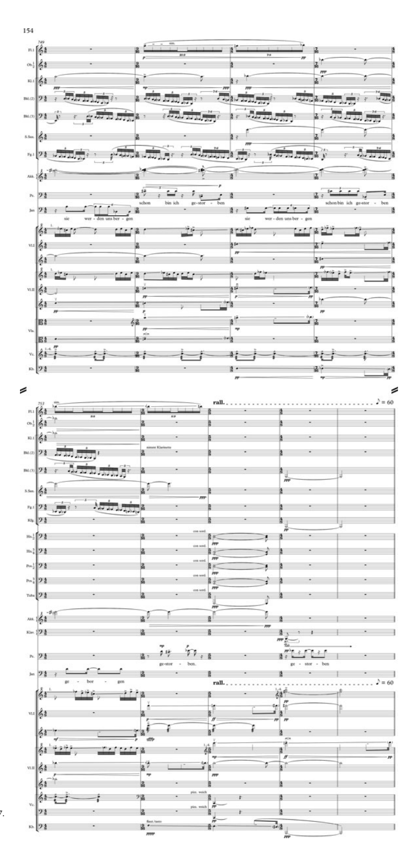
Example 1: End of Peter's 'Angstarie', Violetter Schnee (Act I, Scene 14), bars 749–57. © Bärenreiter Verlag, used with permission.