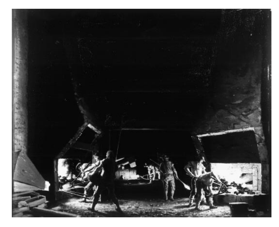
Figure 2. The interior of a Walloon forge by the Swedish painter Pehr Hillestrom, c. 1790. Jernkontoret Library, Stockholm

making of bar iron "Requires forgemen that have been Breed up to those Errors". How much better it would be, one ironmaster mused, if an entirely new division of labour could be imposed "in order That These Refiners Should See Themselves of The Less Consequence, & by which They will be proportionately Less Insolent".<sup>25</sup> Iron puddling achieved precisely that.<sup>26</sup>