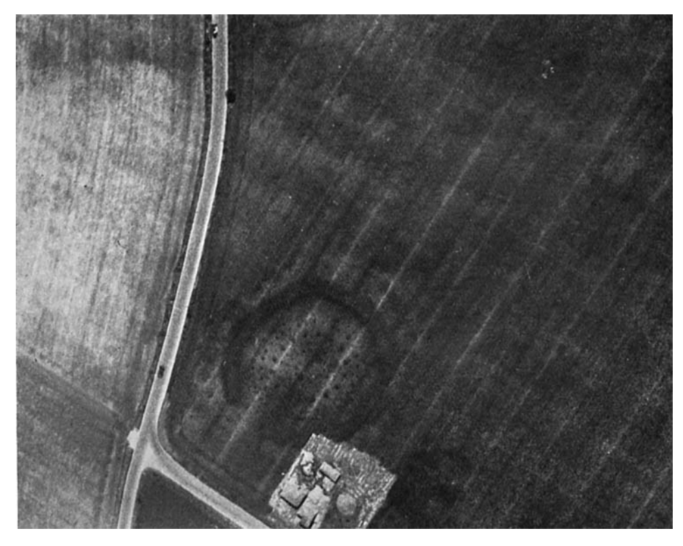
2.—"WOODHENGE": VERTICAL VIEW TAKEN 30 JUNE, 1926, FROM A HEIGHT OF 4000 FEET, BY SQUADRON-LEADER INSALL, V.C., M.C. Reproduced by permission of H.M. Stationery Office