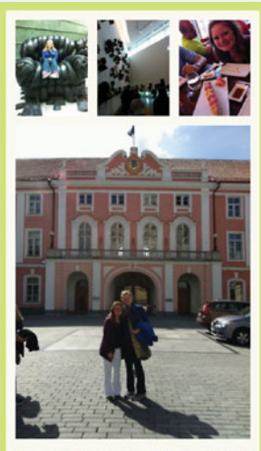
Eventually the group made it from Tartu to Parnu and other Russian villages all the way back to the great city of Tallinn!

At an Art Museum Kuuli our tour guide works at, we were able to see lots of really great