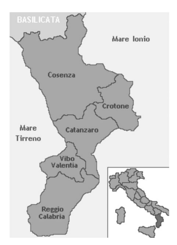
Figure 2. Provinces of Calabria n.d. (online), accessed 29 August 2022. https://www.italyheritage.com/visit-italy/ita/regioni/calabria/