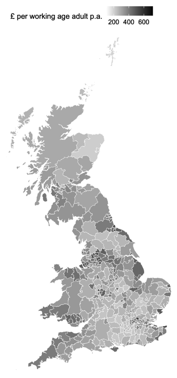
Figure 1. Distribution of the austerity shock in the UK - Source: Beatty and Fothergill (2016).

to £720 in Blackpool, with a standard deviation of £84. Figure 1 displays the geographical variation of the austerity shock, per annum, across districts in the UK. I use this estimate as a proxy for the regional intensity of the austerity measures voted in 2012. In particular, I compare individuals across districts subject to different austerity shocks.