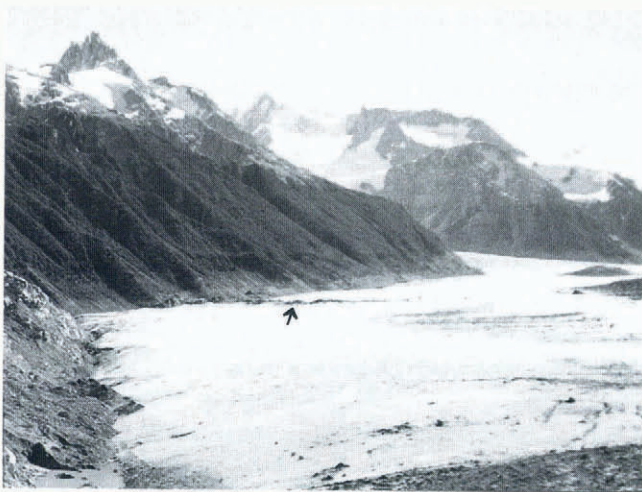
Fig. 3. A partial view of the southern flank of Glaciar Arenales, with the ellipse of debris material to be seen (arrowed) on its surface in the middle distance, about 3.5 km from the camera.

Arenales which, after joining Glaciar Colonia, flows to a joint terminus 3.5 km further downslope. Although it is difficult to be very precise when using aerial photographs without specialist equipment, the approximate accuracy of our indirect approach to measurement of ice-surface velocity is supported by the degree of correspondence between the indirect and direct values obtained by Aniya and Naruse