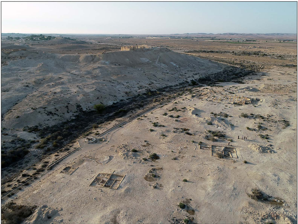
Figure 2. Aerial view of ancient Nessana showing excavation areas.