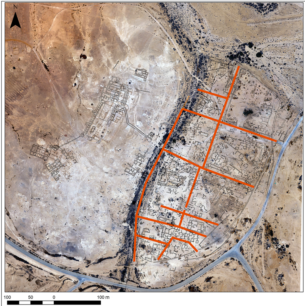
Figure 3. Survey map of ancient Nessana with main street arteries highlighted in red (drafting by Y. Shmidov).

been the focus of another study (Betzer 2021). Rubbish mounds of the site were also excavated within the framework of a wide-scope project on the Byzantine–Islamic transition in the Negev (Tepper et al. 2020).