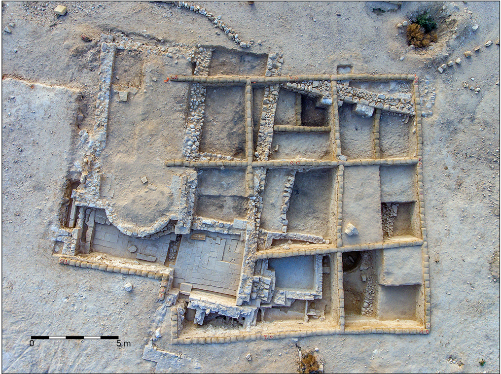
Figure 4. A pilgrimage hostel complex partly exposed during the 2023 excavations.

compiled and collated to ascertain the overall plan of the site and the spatial outline of its main arteries and public spaces, which had so far remained archaeologically obscure.