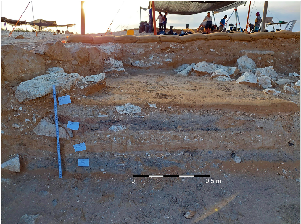
Figure 6. Excavation profile showing the deposition of decline and abandonment layers, Area CC, view to east (photograph courtesy of the Nessana Expedition).

Owing to the arid desert climate, Nessana is exceptional in the high preservation of organic materials such as textiles, leather, baskets and botanical remains. Even in the first season of the renewed excavations, numerous botanical remains were collected, together with textile and leather fragments, and wooden beams (Figure 5).