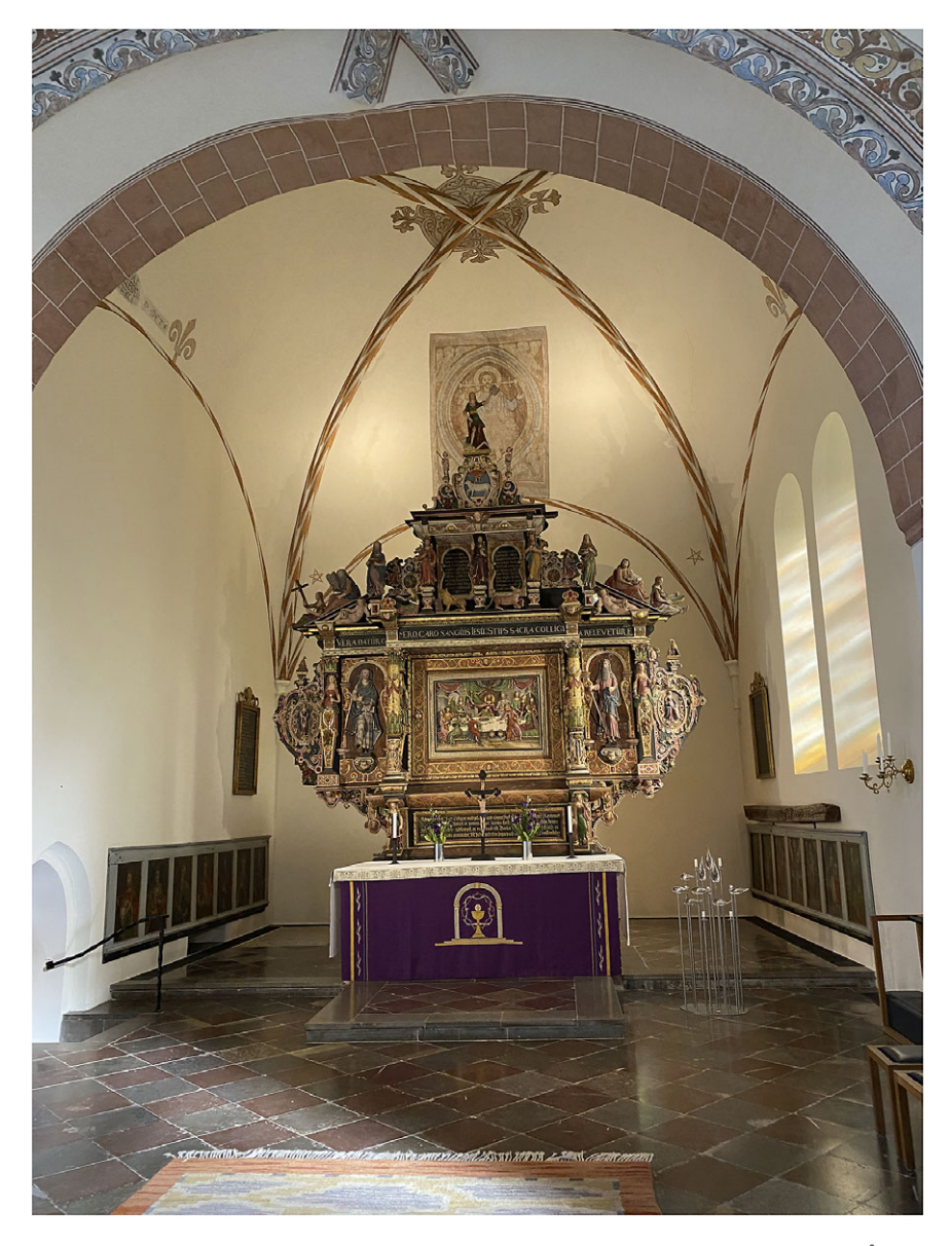
Image 4. Example of the interiors of a Swedish church: the choir and 17th century altarpiece of Åhus church.

times of war was criminal. However, to date, no site in Sweden falls under enhanced protection, and there have not been (as of February 2024) any systematic actions taken addressing the precautions in Protocol II of "the preparation for the removal of movable cultural property or the provision for adequate in situ protection of such property." ^{71}