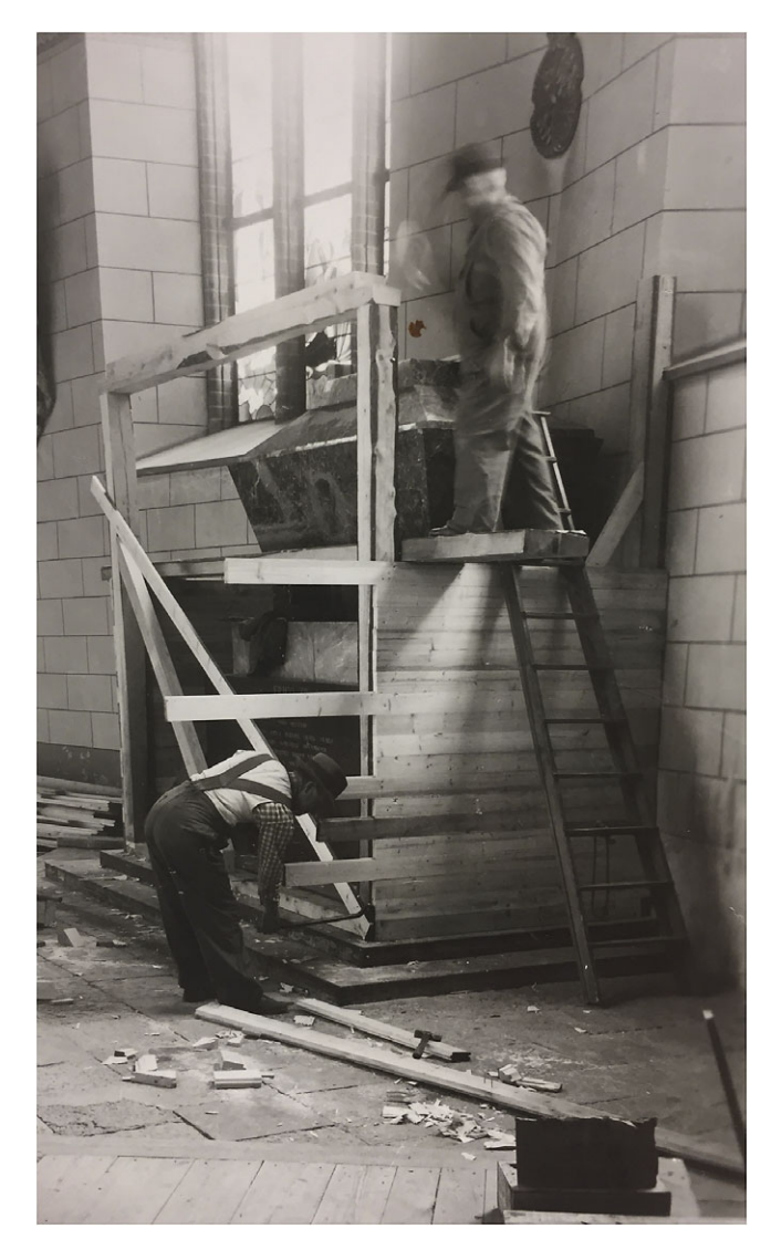
Image I. A protective structure is being built around the tomb of King Erik XIV in Västerås Cathedral, April 1940. Courtesy of Västmanlands Läns Museum, Vlm-A 658. Photographer unknown.

population's resistance and strike directly at the enemy's economy. Even if there had been international negotiations about the possibility of limiting the extent of future aerial warfare, the great powers were unwilling to refrain from using the full potential of bombers. Invaded or not, cities and industrial centers could easily be bombed from the air by enemy bases located on the opposite side of the Baltic Sea. Beginning in 1937, an organization for air raid protection was built, which followed the German model. Swedish territory was divided into four classes of air protection zones depending on the threats