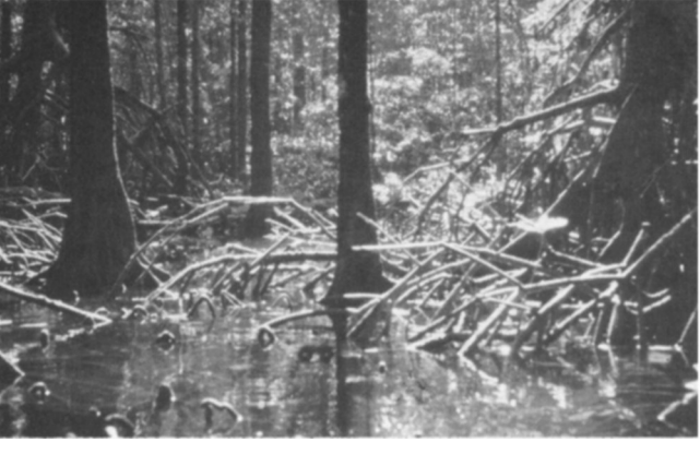
Mangroves on Buru

complete account of Maluku's natural history. The centuries-old trade in spices, notably clove and nutmeg, that made these islands famous in the past, is still sizeable, but other exports are now more important — especially timber, marine products and live birds, the uncontrolled exploitation of which has an undesirable effect on the environment.