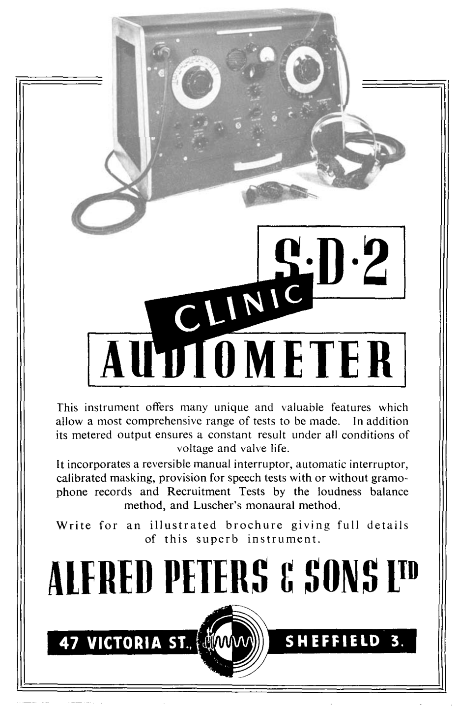
Please mention The Journal of Laryngology when replying to advertisements