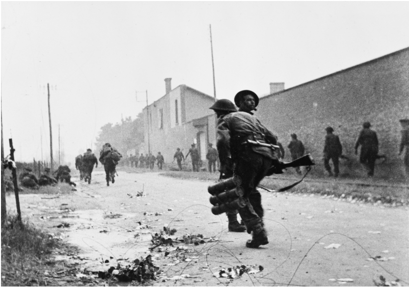
Illustration 13.2 British Commandos advance towards Ouistreham, Sword area, 6 June 1944. In spite of the notable feat of arms of D-Day, controversy still rages over whether British and Canadian forces should have pushed more aggressively inland to take their D-Day objectives.

commanders in Normandy. 141 A more dynamic approach once the beaches had been taken would have required Second Army to utilise its battle drills in preference to firepower-heavy tactics. 142 In the complex, fearful environment of D-Day, this was an unrealistic expectation. 143