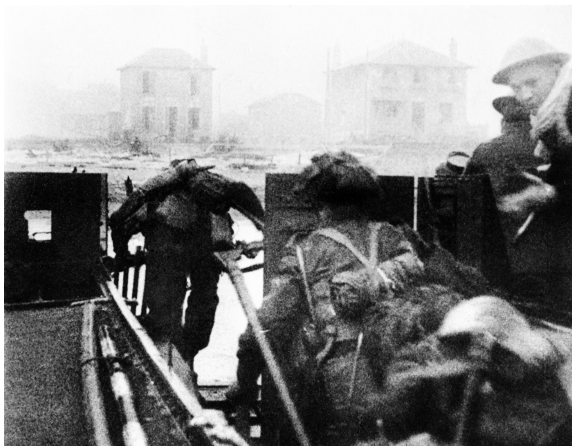
Illustration 13.1 Troops of 3rd Canadian Division disembark from a landing craft onto Nan Red beach, Juno area, near St Aubin-sur-Mer, at about 0800hrs, 6 June 1944, while under fire from German troops in the houses facing them.

squadrons assigned to attack beach targets found the winds and overcast skies a serious challenge. 99 The bombardment from the sea was only marginally more effective. Major John Fairlie, a Canadian artillery officer, who conducted an exhaustive investigation of Juno beach after the battle, concluded later that naval fire had done ‘no serious damage to the defences’. 100