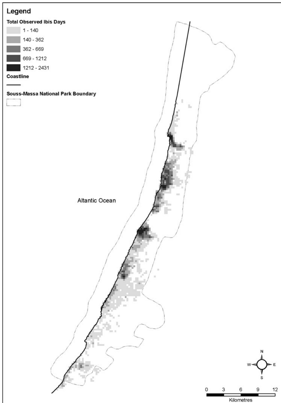
Figure 2. Map of utilization for foraging by Northern Bald Ibis of 300 m x 300 m squares in Souss-Massa National Park in 1995 – 2005.