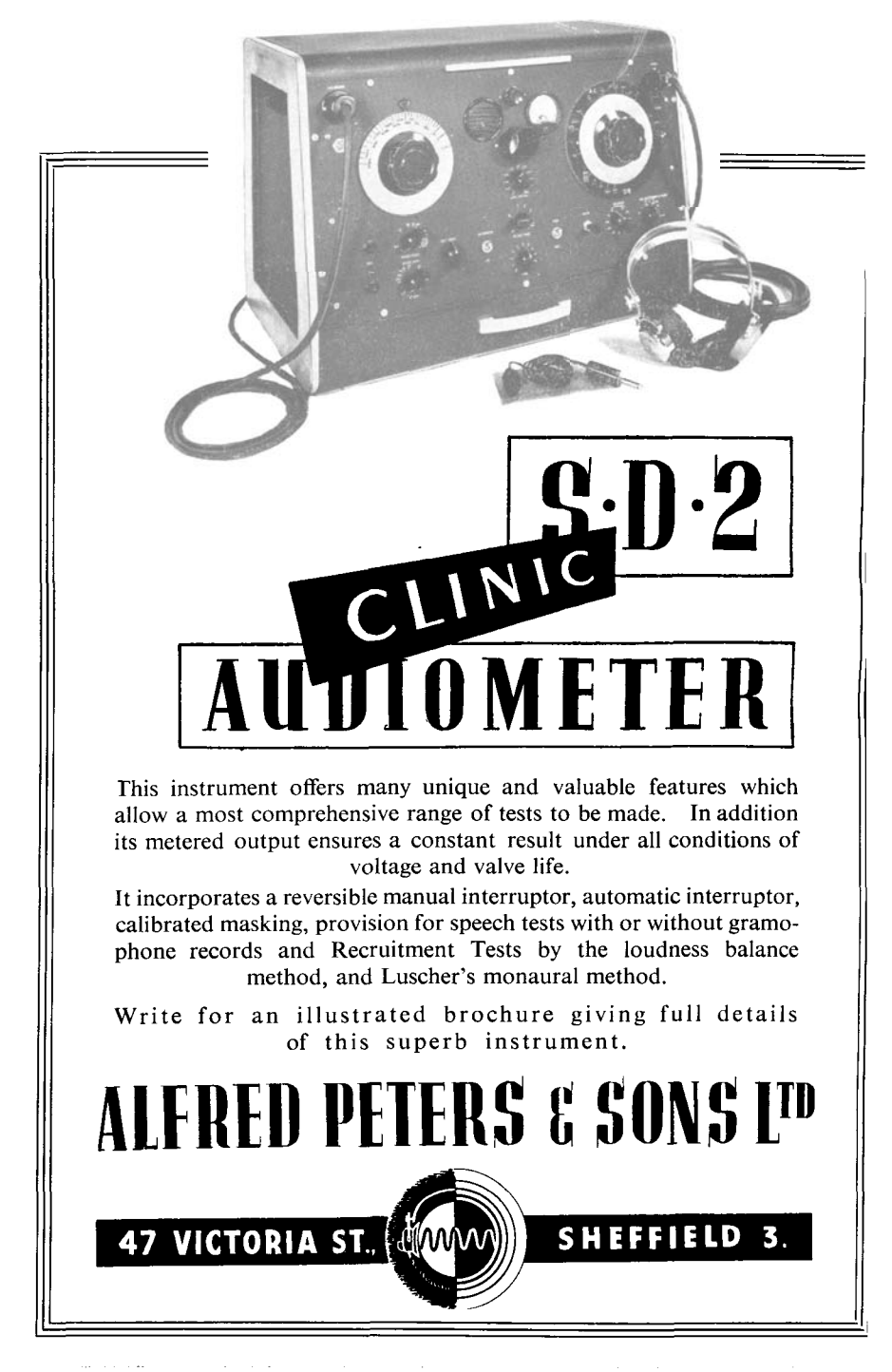
Please mention The Journal of Laryngology when replying to advertisements