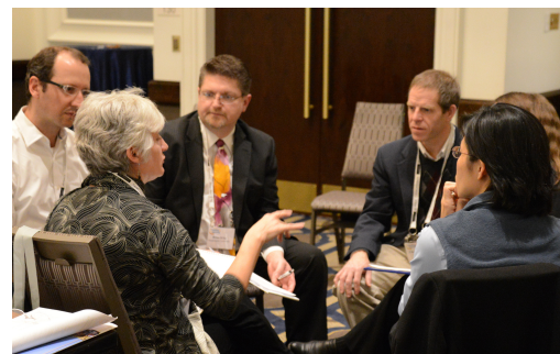
Short course participants at the Teaching and Learning Conference discuss their ideas in a break-out session.

Participants gather after the opening reception of the 11th Annual APSA Teaching and Learning Conference, held February 7–9, 2014, in Philadelphia. More than 300 attended the event. Details and the conference track summaries will be published in the July 2014 issue of PS.