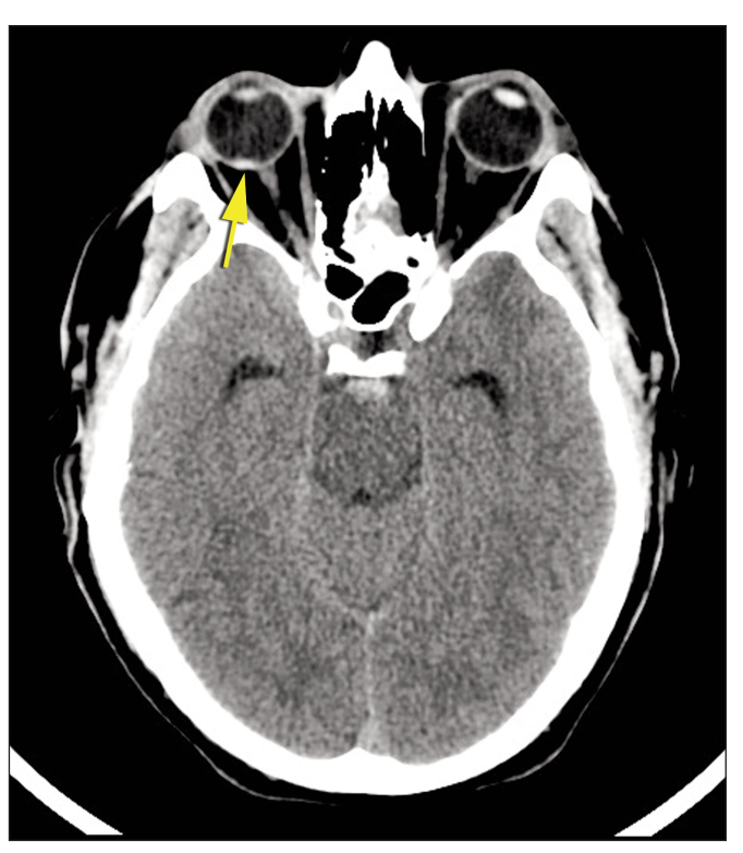
Figure 1: CT scan demonstrating SAH with an associated hyperdense crescent at the level of the retina of the right eye, corresponding to an intra-ocular hemorrhage.

Terson's syndrome is reported to occur in 2.6 to 27% of patients following SAH, depending on how carefully the diagnosis is sought<sup>8</sup>. Patients with subhyaloid hemorrhage generally complain of scotoma as compared to those with vitreous hemorrhage, who report blurred vision and floaters. Typically, patients with TS have a worse clinical SAH grade on admission<sup>6,8</sup>, likely in part due to the sudden increase in ICP required to cause intraocular hemorrhage. The acute increase in ICP immediately following SAH may last only a few minutes<sup>9</sup>,