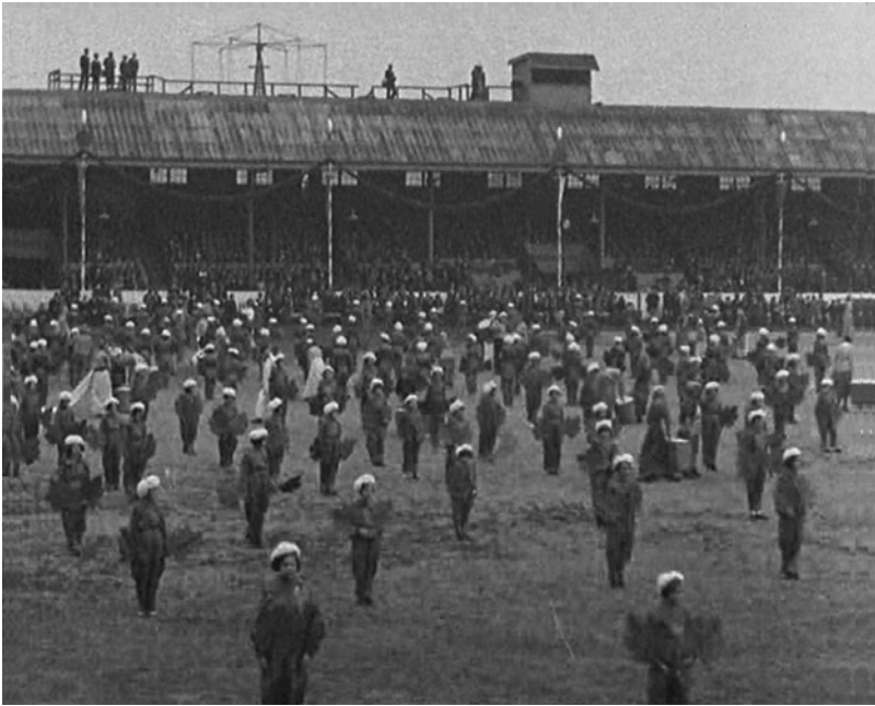
Figure 1: Children dressed as buds of cotton during the opening scene of the Lancashire Cotton Pageant 1932. British Pathé, Film ID: 679.12.

performers, commemorating the centenary of the opening of the Liverpool and Manchester Railway. 77 In 1932, Anderson hit the ‘big-time’ with the Lancashire Cotton Pageant, and truly began using pageantry to put the ideals of civic publicity into practice. 78 Performed 16 times in Manchester’s Belle Vue gardens, the pageant had a cast of 12,000, and attracted crowds totalling 200,000. The pageant was organized by the Joint Committee of Cotton Trades’ Organizations, the Lancashire Industrial Development Council and the Manchester Development Committee, and was also supported by mayors and councillors from surrounding towns and cities, such as Liverpool, Stockport and Oldham. 79 The narrative created a both allegorical (see Figure 1 ) and literal story of cotton, with scenes such as Cotton in Ancient Times, The Age of Inventions (featuring inventors such as John Kay, with his flying-shuttle) and Lancashire at Work (depicting the working-life of the mill operative). 80