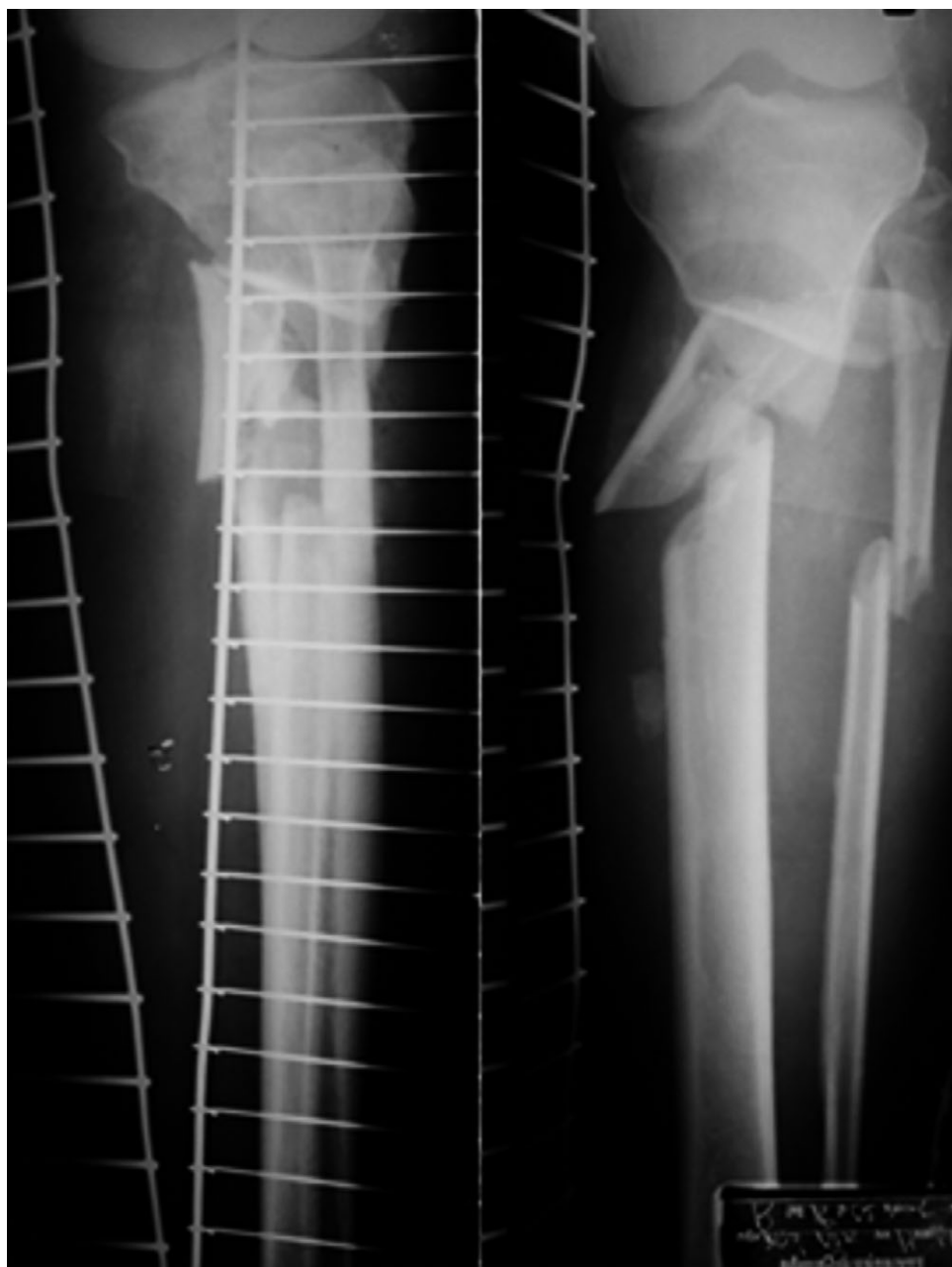
Figure 2b. Comminuted Open Fracture of the Tibia.