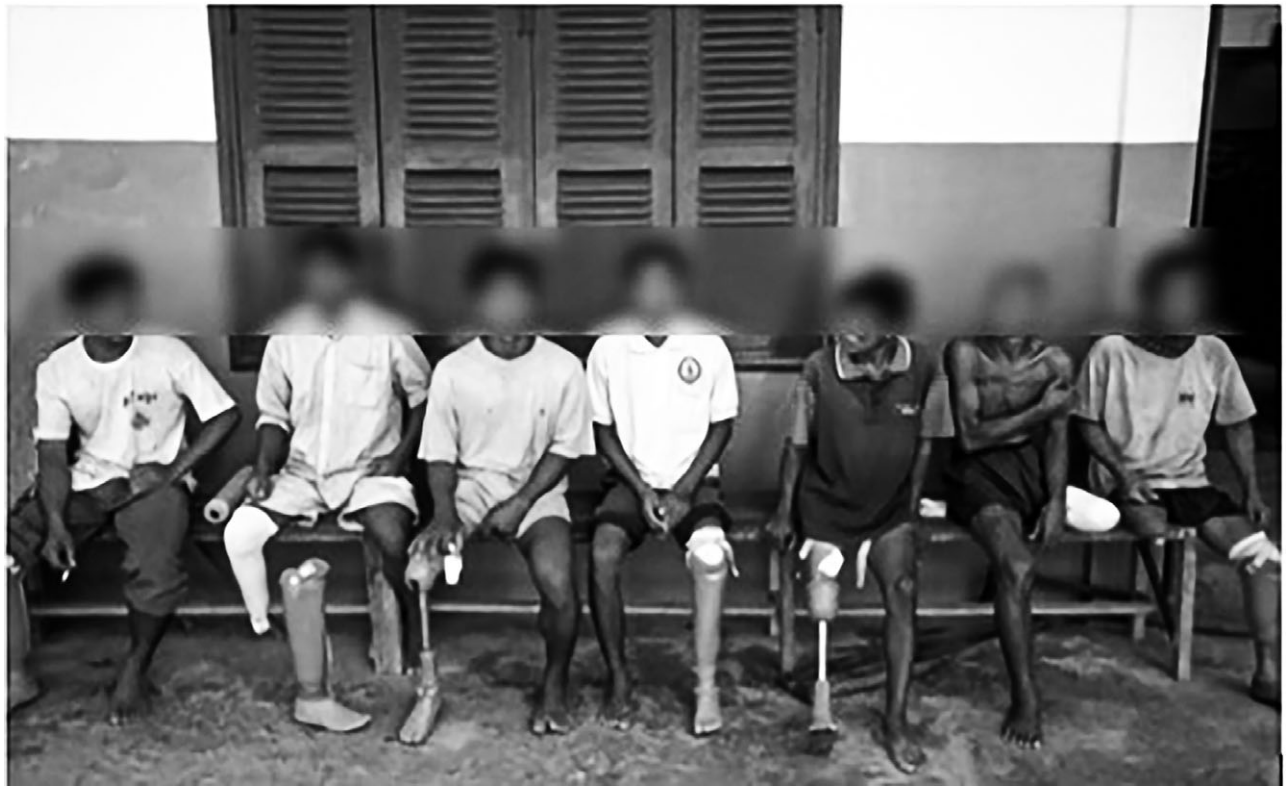
Figure 1. Disability and Poverty as a Global Challenge: Save Limbs, Save Lives.