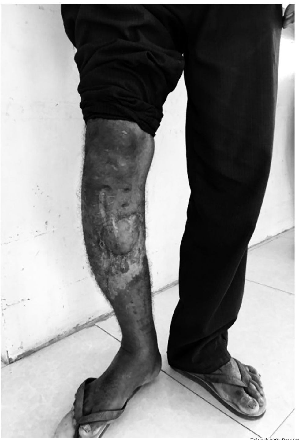
Figure 2f. Fracture Healed after 10 Months, Full Weight Bearing.