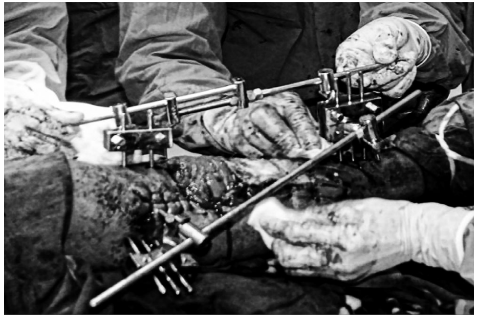
Tajsic © 2022 Prehospital and Disaster Medicine