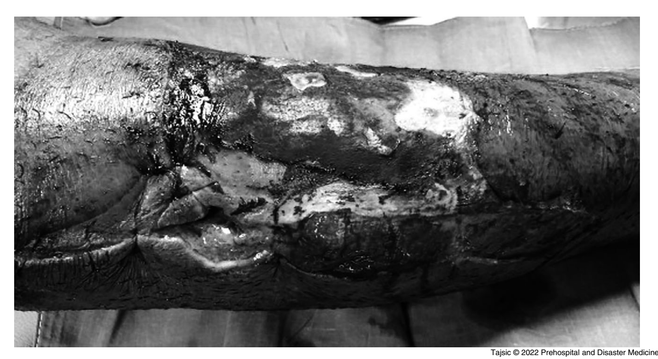
Figure 2a. 53-Year-Old Man with Severe Limb-Threating Injury after being Struck by Car.

documentation of soft tissue injuries were mandatory to understand the use of the open fracture classification systems (Figures 2a, 2b, 2c, 2d, 2e, and 2f).