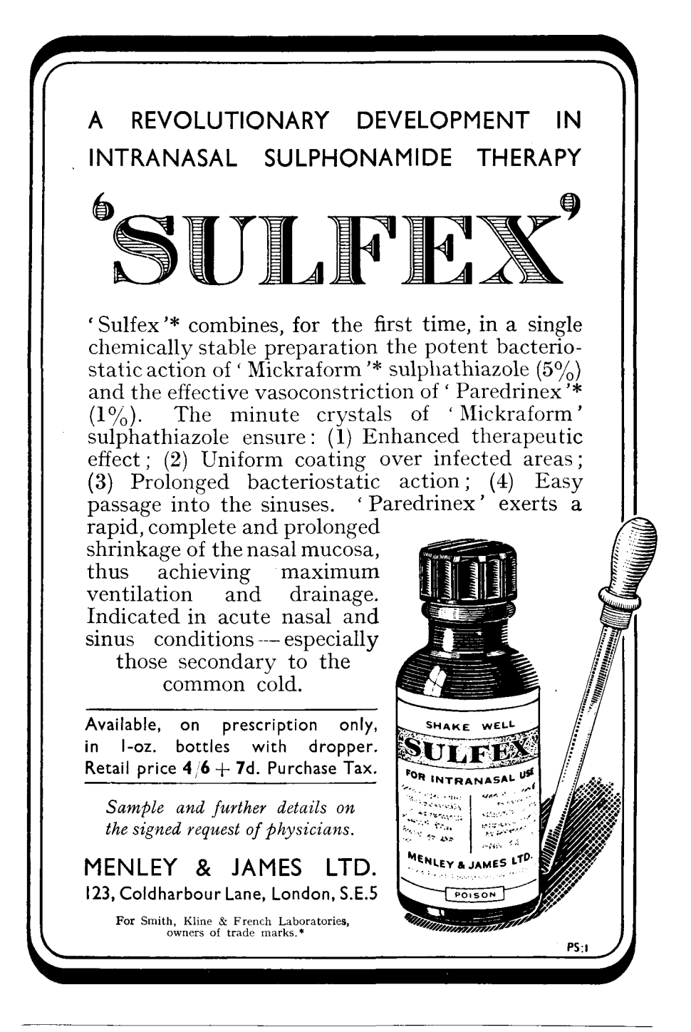
Please mention The Journal of Laryngology when replying to advertisements