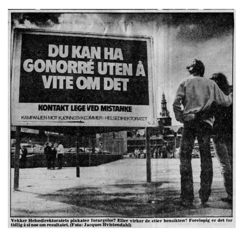
Figure 1: Facsimile from the newspaper Dagbladet 28 June 1979, of a high-profile public gonorrhoea campaign. The poster says: 'You can have gonorrhoea without knowing. Seek a doctor if you are concerned.'

needs of gay men.<sup>68</sup> A group of physicians wrote in a letter to the chief medical officer that many homosexual men were asymptomatic, but reluctant to get tested in the regular healthcare system for fear of being outed or of having to disclose their sexual orientation; sexually transmitted diseases would remain unrecognised if patients avoided informing their primary doctors about their sexuality and who they had sex with, the doctors argued.<sup>69</sup> The gay and lesbian organisations DNF-48 and FHO also urged the health authorities to quickly establish a special health service for gay men, at the same time they underlined that they would reach out to gay men about getting somatic check-ups regularly and organise information meetings.<sup>70</sup> These initiatives bore fruit. From September 1983, the Health Council offered somatic health check-ups, treatment for sexually transmitted diseases and vaccination against hepatitis B, and the opening of the clinic was reported in the press.<sup>71</sup> The clinic would serve the population in the eastern and southern parts of Norway,