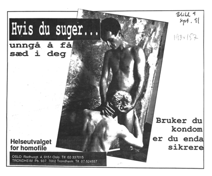
Figure 2: Safer sex ad from the Gay Health Committee, Blikk, 9 September 1991. The advertisement says: 'If you give blowjobs . . . don't get semen in you. If you use a condom, you're even safer.'

not to cough directly at one another.' <sup>106</sup> The folder is a stark reminder of the fact that even if the HTLV-III virus was identified in studies in 1983 and 1984, it still was not clear in 1985 whether the virus was a sufficient factor in pathogenesis, or if other cofactors had to be present. <sup>107</sup> The immunosuppressive role of other men's semen, poppers or Cytomegalovirus (CMV) infections could still not be completely ruled out, and the folder repeated the importance of good hygiene 'before and after sex', that one should stick to one partner and avoid anal sex or 'the transference of bodily fluids'. <sup>108</sup> Even kissing was not without risk, it was thought, even if the risk was much less than for anal sex.