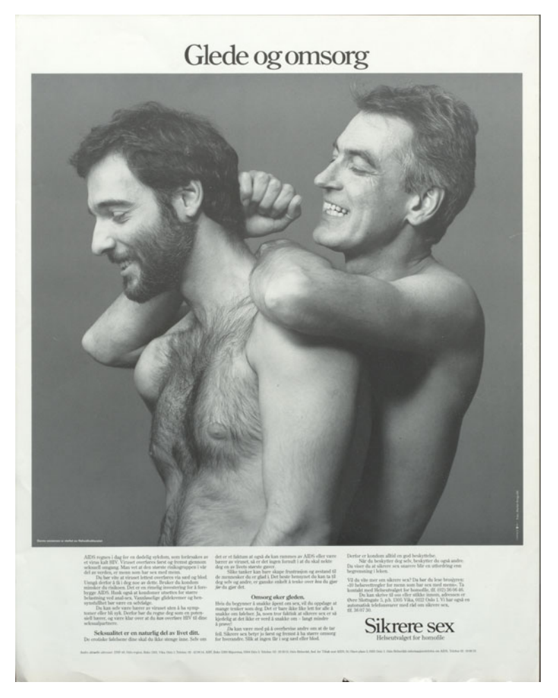
Figure 5: 1986 safer sex campaign by the Gay Health Committee, titled 'Pleasure and Care'.

run, AIDS complicated the coming-out process for many men and women and added to a stigma that was already widespread in society. <sup>199</sup> 'AIDS has led to increase in gay bashing which also affect lesbians, even if lesbians as a group are not at risk of AIDS', the Gay Health Committee stated in the first working programme from 1986. <sup>200</sup> It added that coming out for gays and lesbians had become harder and the struggle for rights and freedom was about to stagnate. On the other hand, AIDS made queer liberation much more visible, as activists got access to the press and to politicians in completely new