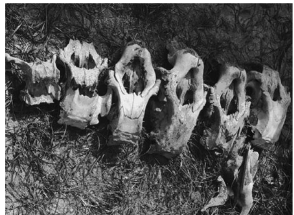
Plate 1 Dugong skulls found in the yard of a dugong hunter in Phu Quoc Island, Vietnam.

In An Thoi respondents agreed that dugong conservation is important, but not as important as in the past because they are not seen by young people. Seagrass is considered unimportant and of no use. Ham Ninh respondents did not believe that conservation of either