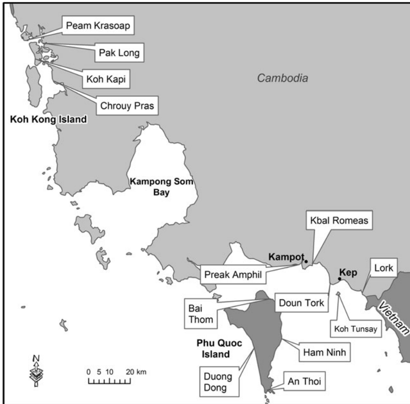
Fig. 3 Interview sites in Cambodia and Phu Quoc Island, Vietnam, in 2002 and 2004.

had been hunted 30, 40 and 50 years previously. Dugongs in both western and eastern Cambodia are occasionally caught accidentally, and fetch a good price in the market, but since there was (in 2004) a proposed MAFF Fisheries law prohibiting catching or selling dugong, they now release animals caught in nets. As the interviewers were from the Department of Fisheries, which enforces this law, these responses may be biased. In western Cambodia four respondents said that dugong can be found in Chrouy Pras, 13 did not know and four said dugong are not found in western Cambodia. Four respondents mentioned that they had recently seen dugongs at the market at Peam Krasoap that had been caught at Chrouy Pras.