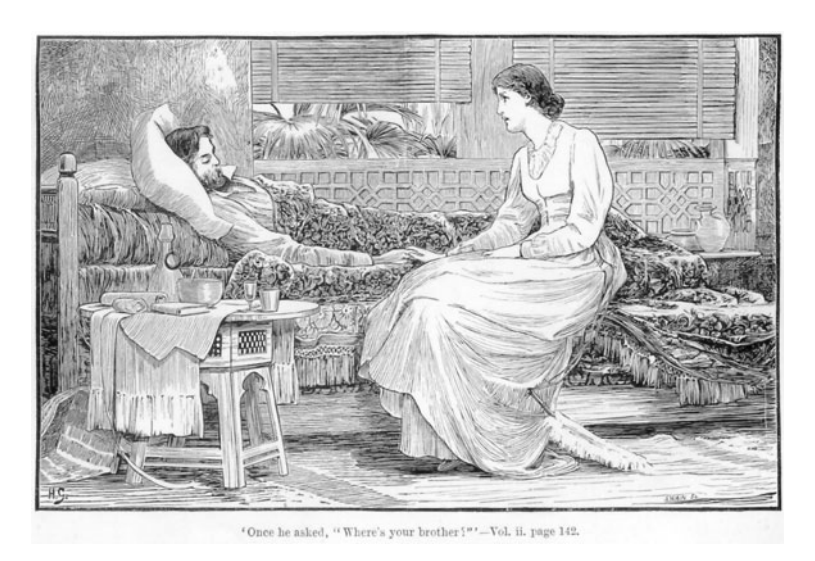
Figure 2. Detailing the aftermath of accidents. Herbert Gandy, "Once he asked, 'Where is your brother?'" Charlotte Yonge, The Pillars of the House (London: Macmillan, 1889), 2:142.

The following table categorizes accidents according to type, as listed in the first column. The second column indicates the frequency of these occurrences, while the third states the number of fatalities and differentiates between minor and life-changing injuries.