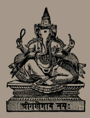
विद्या नाम नरस्र रूपमधिकं प्रच्छन्नगुप्तं ध विद्या भोगकरी यध्रःसुखकरी विद्या गुरूणां गुरुः । विद्या बन्धुजनो विदेशगमने विद्या परं दैवतं विद्या राजसु पूजिता न हि धनं विद्याविद्दीनः पसुः ध्र