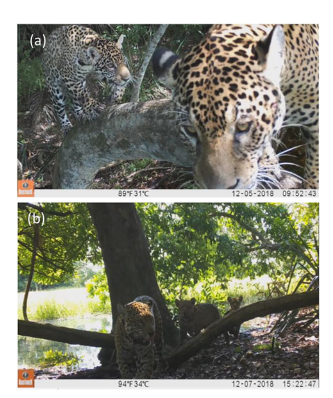
PLATE 2 (a) Jaguar 1 with her 6–7 month old cub, photo-trapped in December 2018, and (b) Jaguar 2 and her two 4–5 month old cubs, photo-trapped in December 2018.

activity was similar to that previously reported for jaguars, with both individuals moving (hunting and transiting) during the night and resting during the day (Kanda et al., 2019). We identified 10 species preyed upon by the two jaguars (Table 2). Social interactions were observed between the two jaguars and nine other individual jaguars), including mating, fighting and paired movement. Jaguar 1 gave birth to a cub in c. June 2018 and jaguar 2 gave birth to two cubs in c. August 2018 (Plate 2).