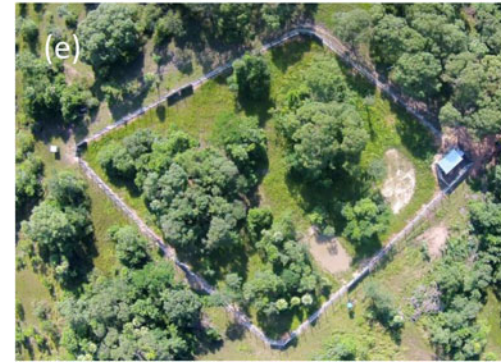
PLATE 1 The 1 ha enclosure in the Caiman Ecological Refuge (Fig. 1): (a) 4.5 m high eucalyptus posts, 3 m apart; (b) 40 cm deep trench excavated around the perimeter of the enclosure and filled with cement, to prevent any animal digging into or out of the enclosure; (c) c. 2 m deep, 60 m² pond; (d) galvanized wire perimeter fence of 2.2 mm gauge and 6 \times 6 cm mesh, with electric wires at 40, 100 and 200 cm, both inside and outside and on the top of the fence; (e) aerial view.