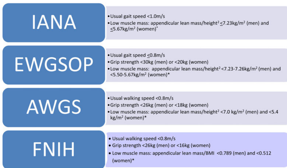
Fig. 3. (Colour online) Sarcopenia is defined by international working groups as the presence of low muscle mass with low muscle strength and/or low physical performance. International Academy on Nutrition and Aging: International working group on sarcopenia (43) ; EWGSOP, European working group on sarcopenia in older people (44) ; AWGS, Asian working group for sarcopenia (45) ; FNIH, Foundation for the National Institutes of Health Sarcopenia project (46) . *Measured by dual X-ray absorptiometry.

morbidity in their own right (40,41,66) . These measures have also been recommended as biomarkers of the healthy ageing phenotype by the National Institutes for Health, being included in the National Institutes for Health toolbox (67) . Indeed some have suggested that markers of low function such as low grip strength could be used as single clinical markers of frailty (68) and usual walking speed has been postulated as the sixth vital sign of health due to its association with a wide range of health states, e.g. cognitive function, mood, motivation, musculoskeletal health and cardiovascular fitness (69) .