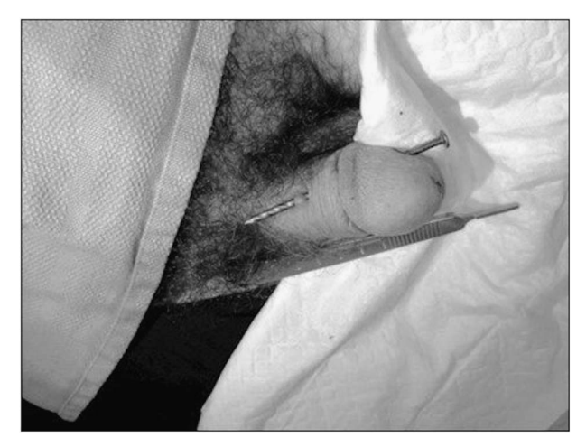
Figure 1. Picture illustrating an unintentional nailguninflicted penetrating penile injury sustained at a construction site.