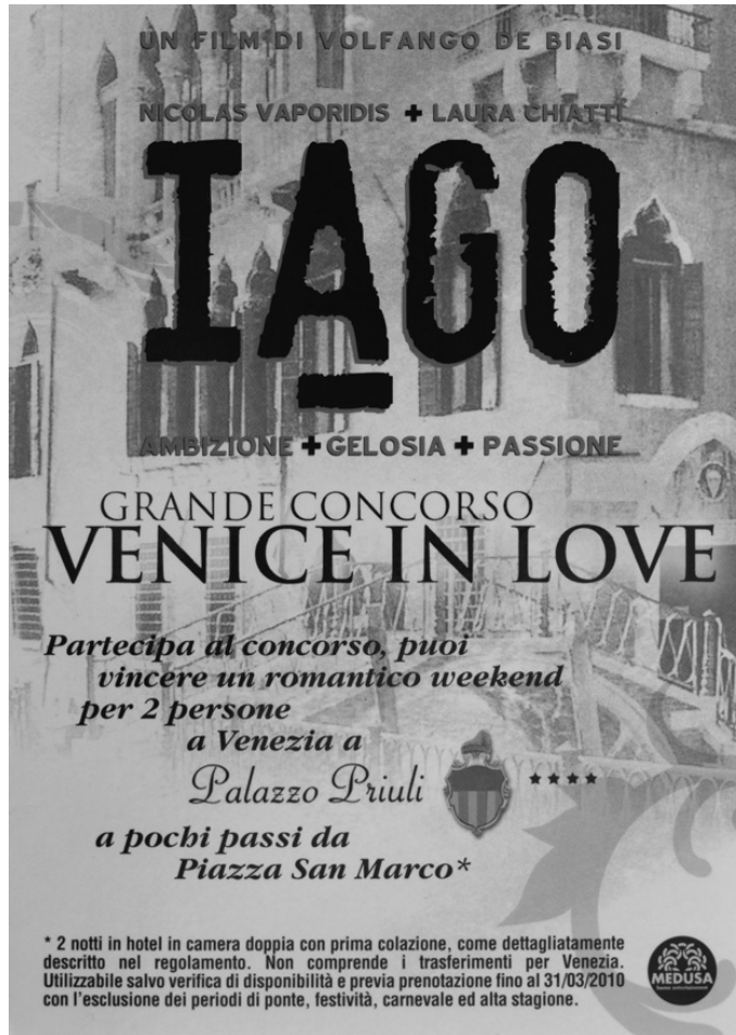
1 Postcard invitation, accompanying the DVD release of Iago (dir. Volfango di Biasi, 2009), to enter a competition to win a romantic break for two in Venice.