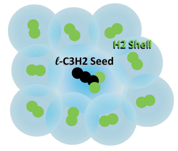
Figure 1. Example CHC.

2001). Here we explore this idea in the context of the physical and spectral parameter constraints associated with CHC spectroscopy.