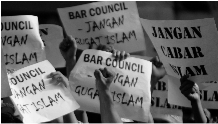
FIGURE 5.3: Protesters hold signs that read “Bar Council, Don’t Threaten Islam” and “Don’t Challenge Islam” during a demonstration against a public forum on legal issues related to religious conversion held by the Malaysian Bar Council in Kuala Lumpur, August 9, 2008.