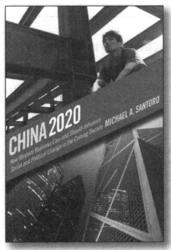
176 PAGES $21.95 CLOTH