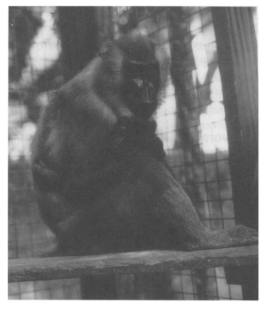
Drills Mandrillus leucophaeus are restricted to a small area in south-east Nigeria, south-west Cameroon and on the island of Bioko.

Drill habitat has become fragmented by roads, settlements, cultivation and other forms of human disturbance, such as timber exploitation. The species appears to have been eliminated from substantial areas of their presumed range by habitat destruction. Probably the greatest threat to their survival is hunting for bushmeat. The species is particularly vulnerable to local hunting methods, in which dogs are trained to hold a drill group at bay in a small tree and a dozen or more may be shot at once. Results of the survey show that most hunting is not for subsistence but part of organized commercial operations. Bushmeat carcasses are smoked for routine pick-up by transport drivers, who buy the meat for resale in urban centres and provide the hunters' camps with ammunition and supplies. As yet, the species receives no effective protection and